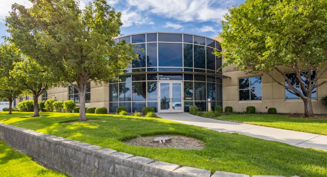
HIGH QUALITY FLEX/INDUSTRIAL BUILDING