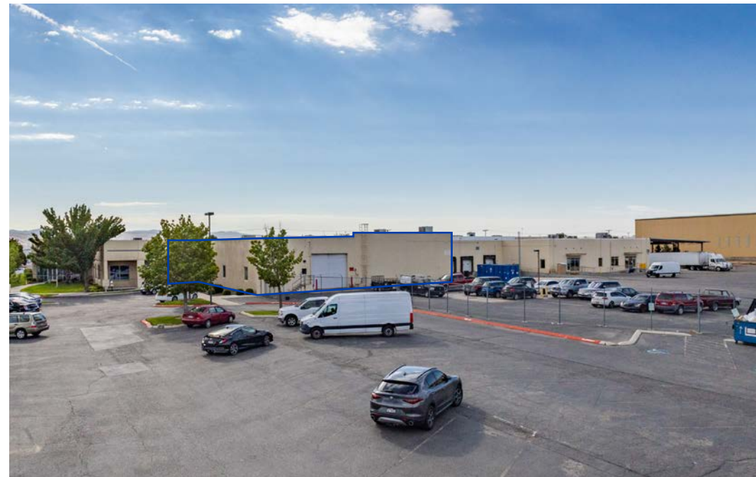
GRADE LEVEL LOADING