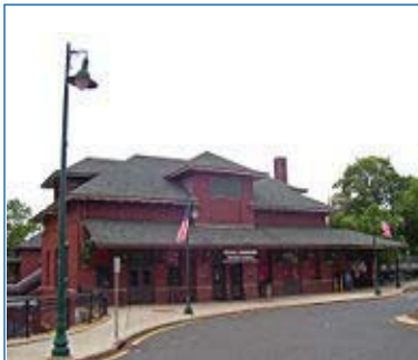
Summit Train Station