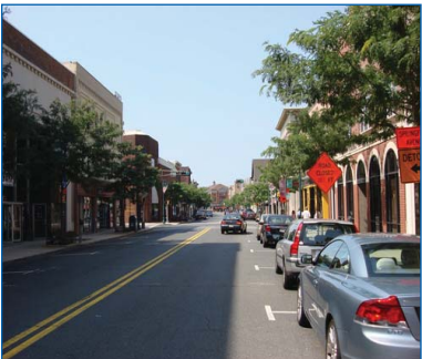
Springfield Ave., Summit