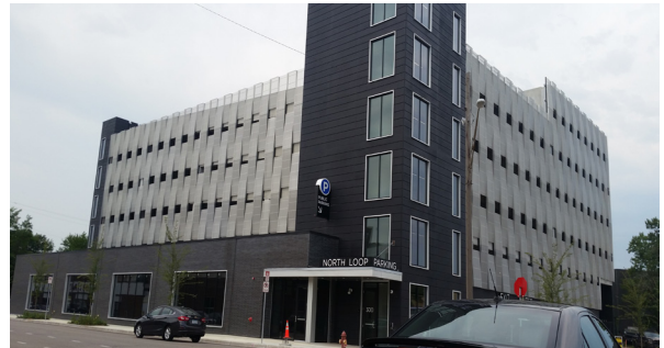
Secure Parking Ramp