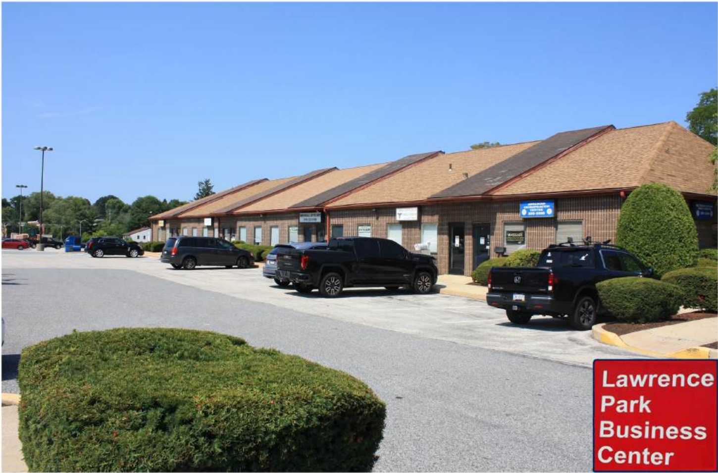
Lawrence Park Business Center