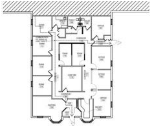
SUITE 1309 C 3,154 SF