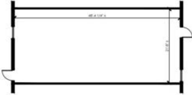
SUITE 1295 C 1,105 SF