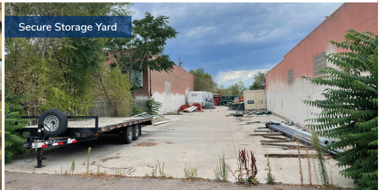
Secure Storage Yard