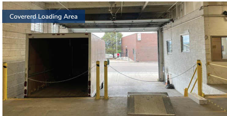
Covered Loading Area