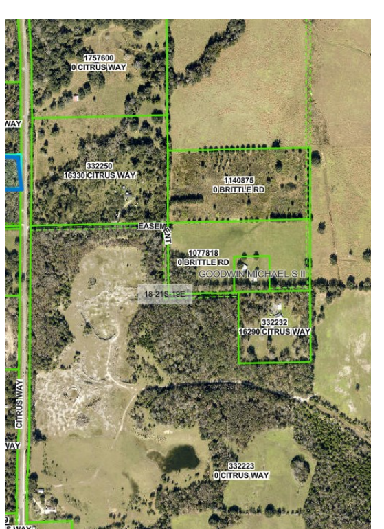
0 Citrus Way 0 Citrus Way, Brooksville, FL 34614