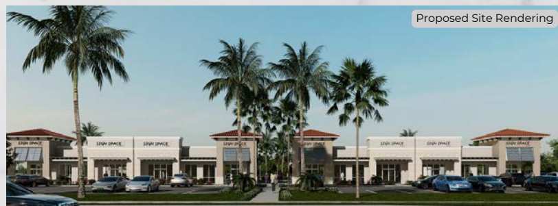
Proposed Site Rendering