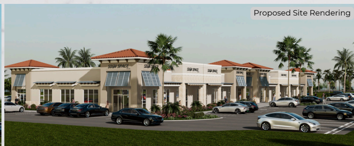
Proposed Site Rendering