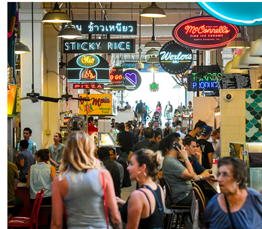
📍 GRAND CENTRAL MARKET