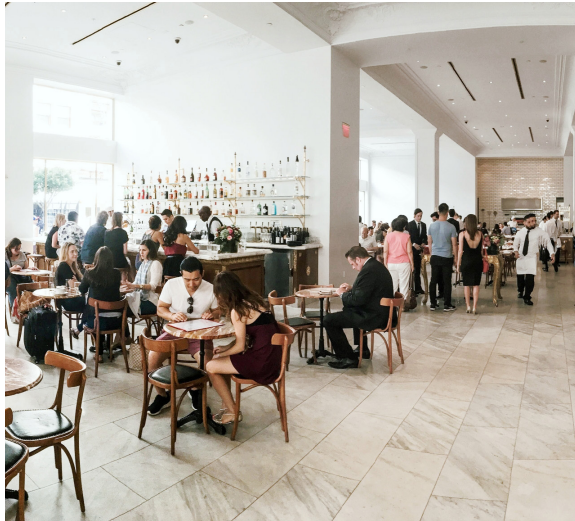
📍 BOTTEGA LOUIE