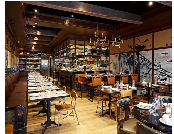
📍 LITTLE SISTER