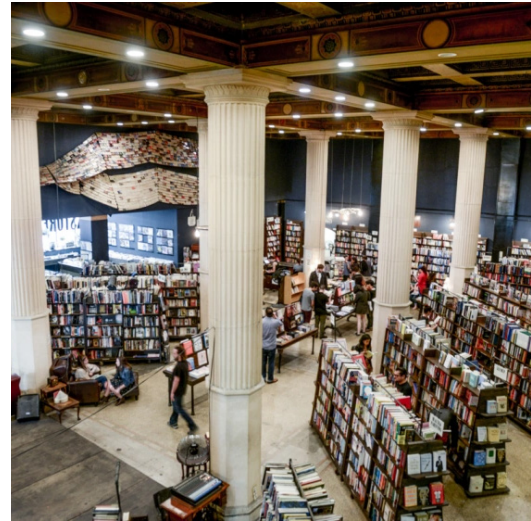
📍 LAST BOOKSTORE