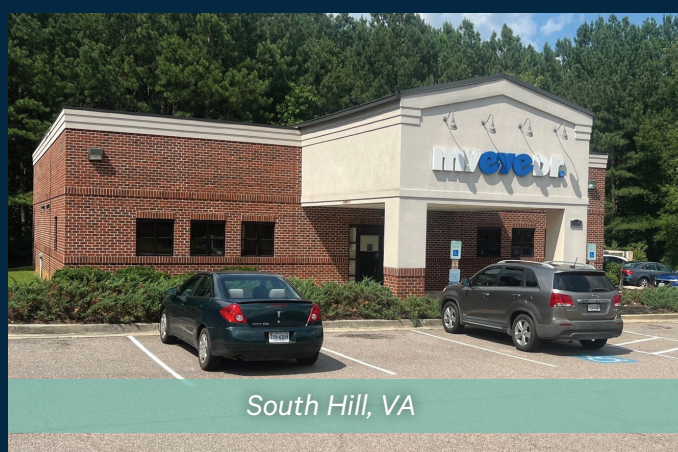
South Hill, VA