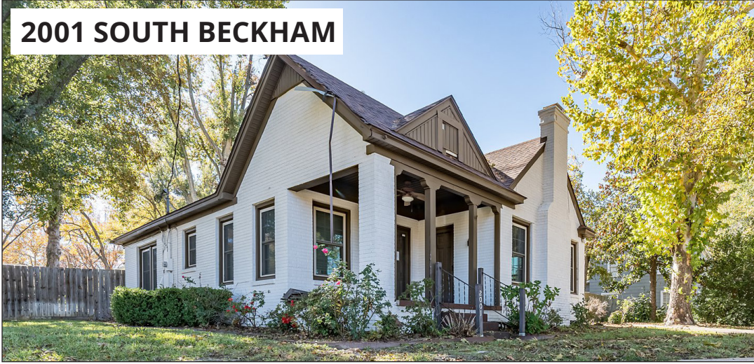
2001 SOUTH BECKHAM

2001 & 2011 S Beckham, 2103 S Fleishel Tyler, TX