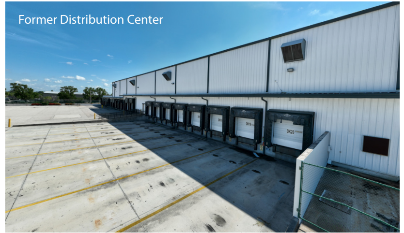
Former Distribution Center