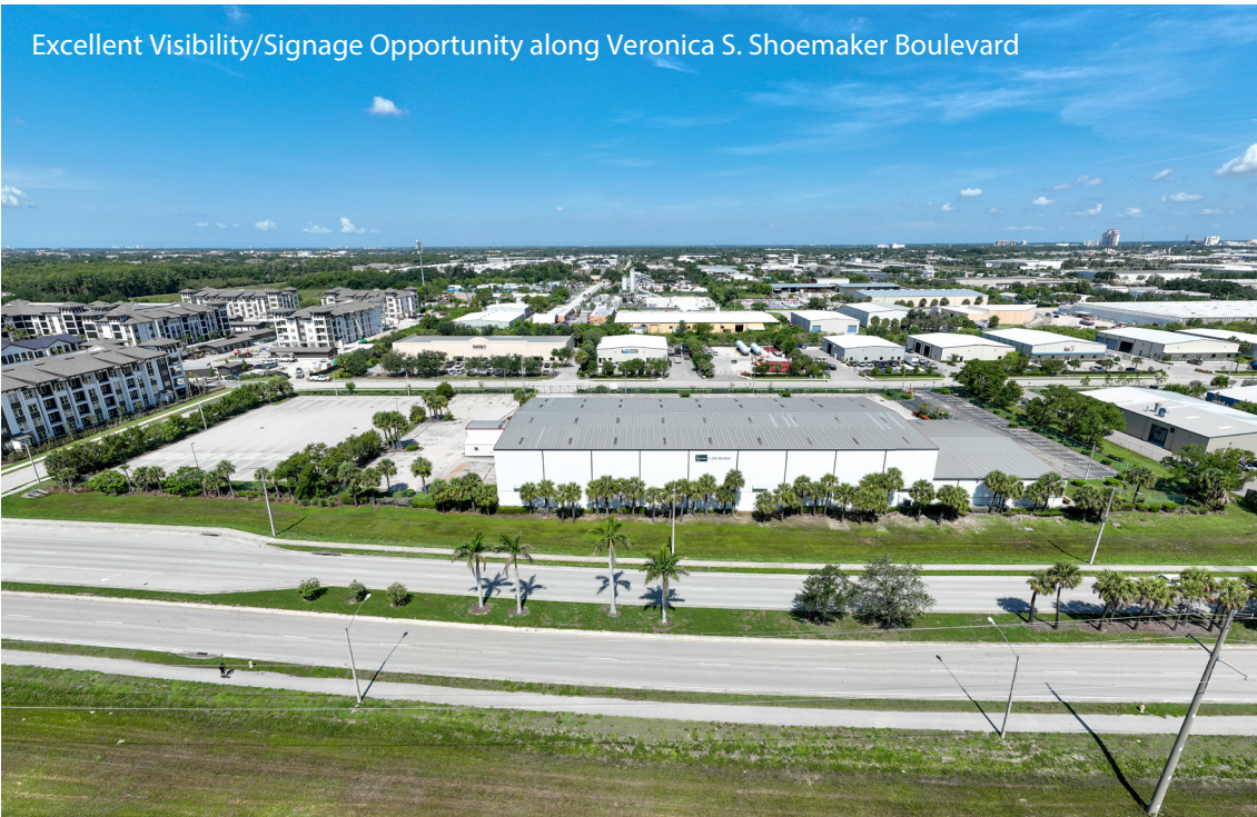
Excellent Visibility/Signage Opportunity along Veronica S. Shoemaker Boulevard