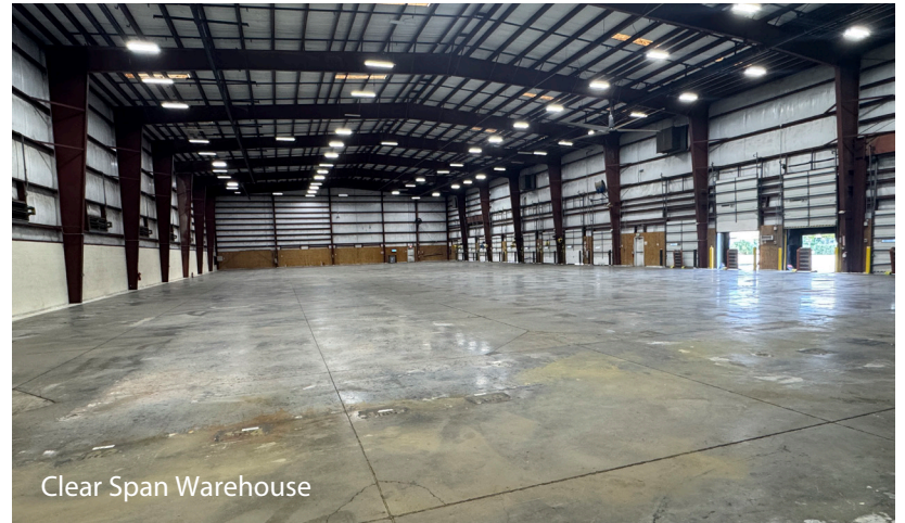
Clear Span Warehouse