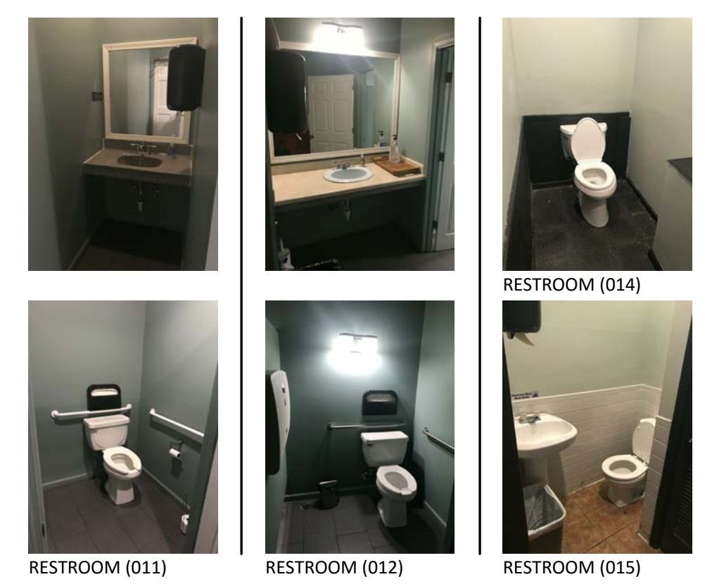
1 RESTROOM COMPLIANCE (PHOTOS) NOT TO SCALE