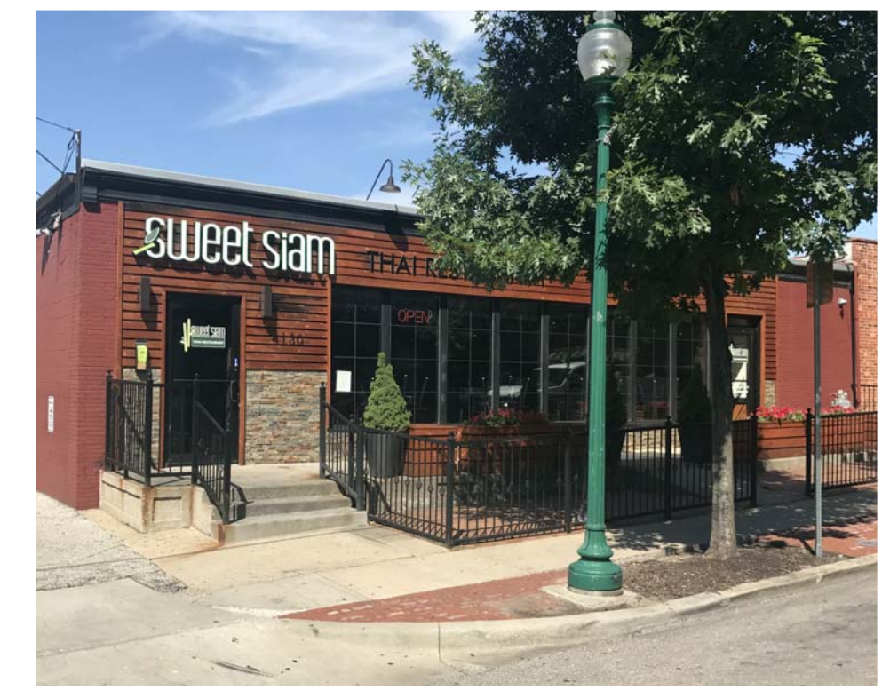
2 ELEVATION (PHOTO) NOT TO SCALE