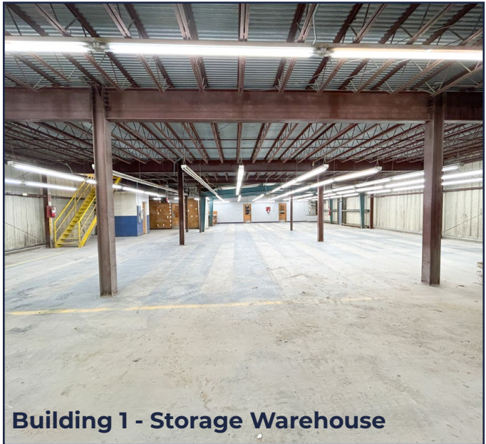
Building 1 - Storage Warehouse