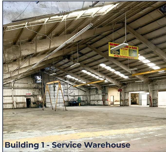
Building 1 - Service Warehouse