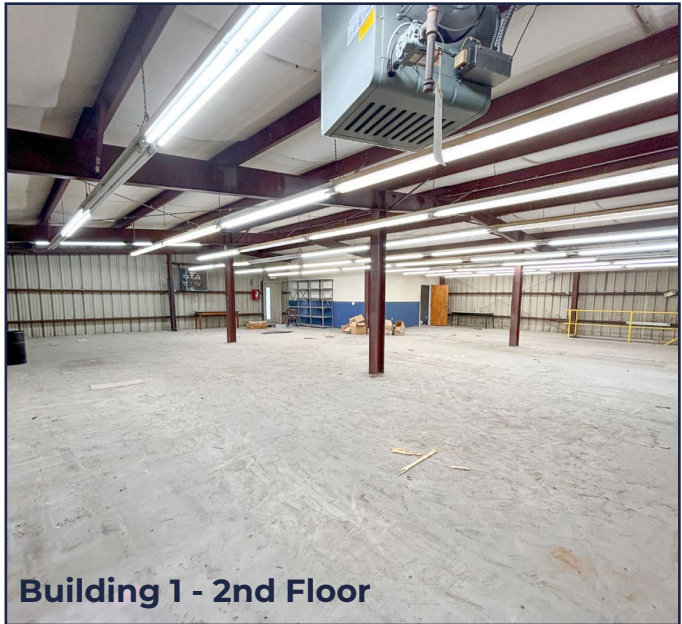
Building 1 - 2nd Floor