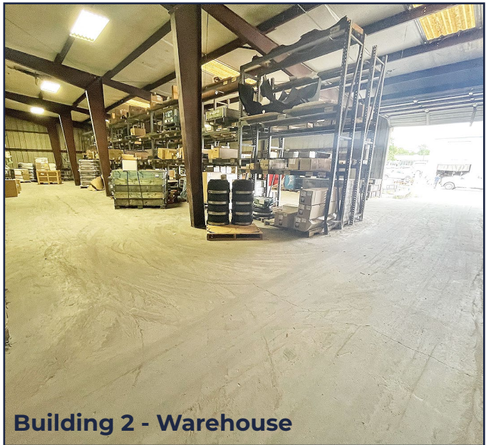
Building 2 - Warehouse