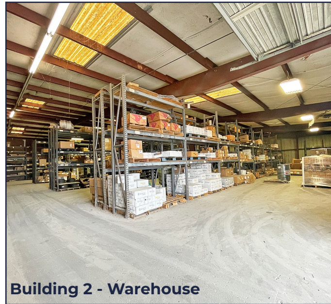
Building 2 - Warehouse