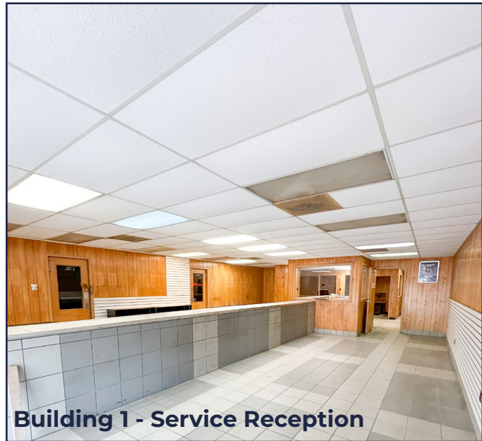
Building 1 - Service Reception