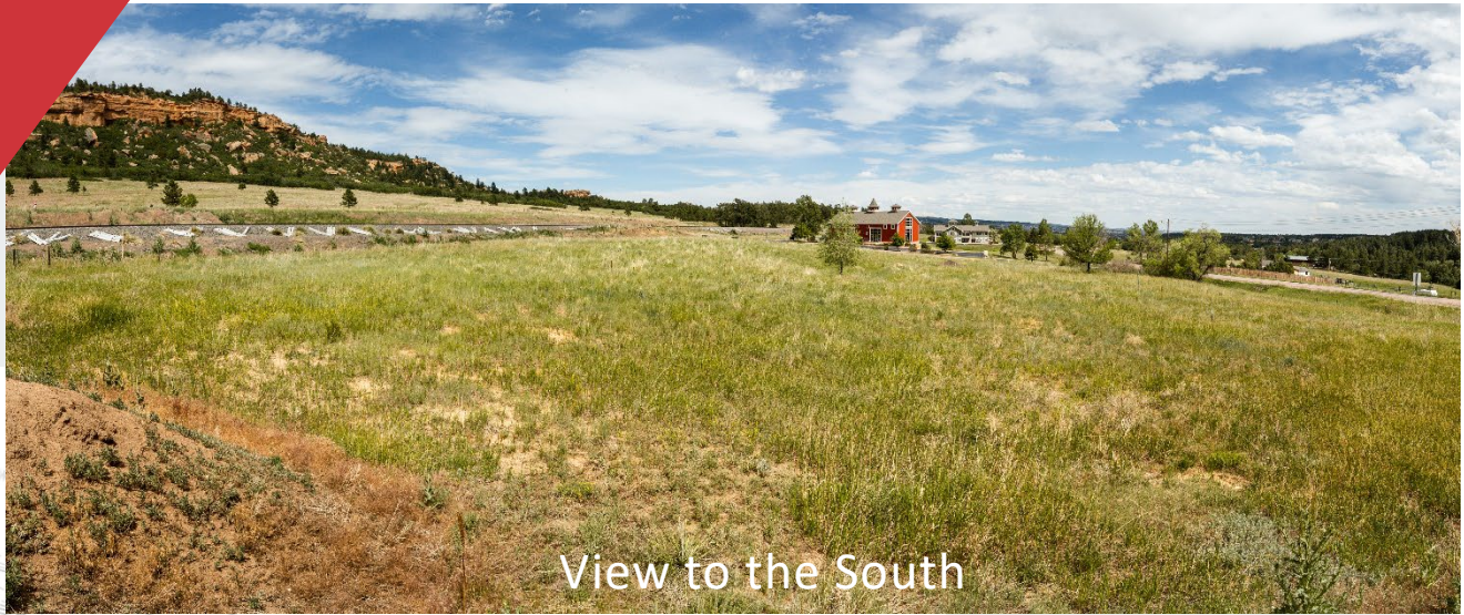
View to the South