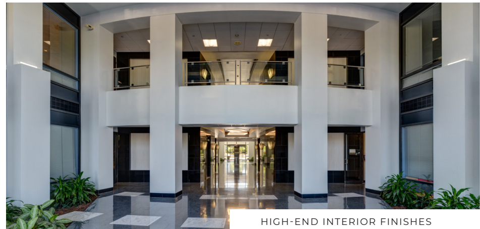
HIGH-END INTERIOR FINISHES