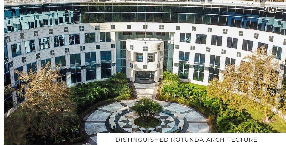
DISTINGUISHED ROTUNDA ARCHITECTURE