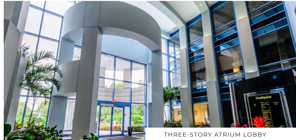
THREE-STORY ATRIUM LOBBY