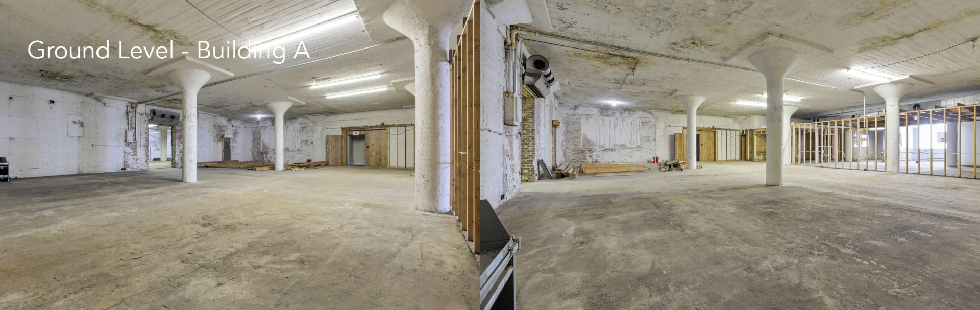
Ground Level - Building A