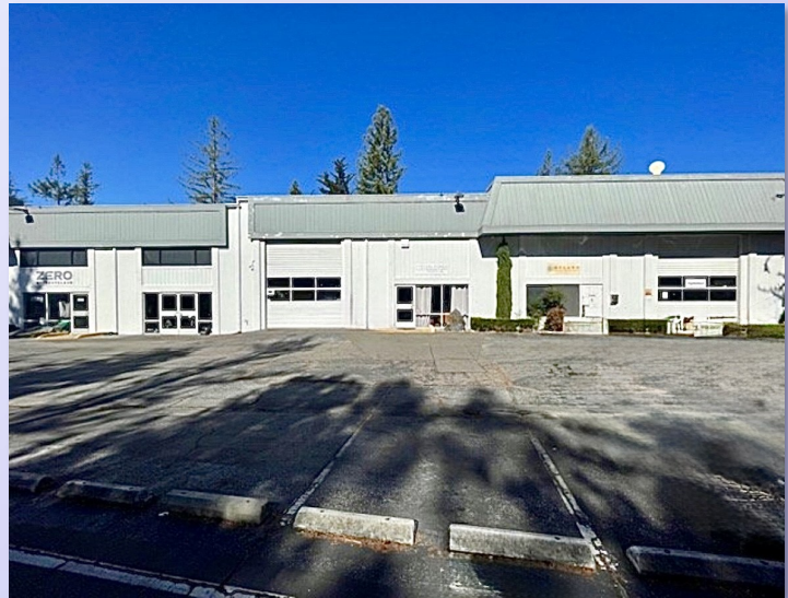
340 EL PUEBLO ROAD Suite C