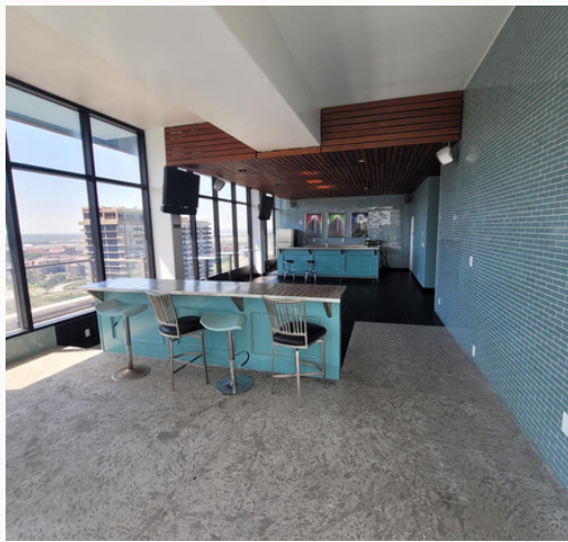
Penthouse Pool Bar