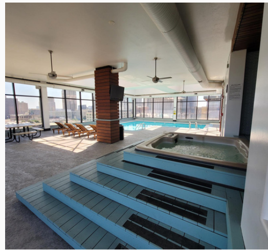
Pent House Pool & Jacuzzi