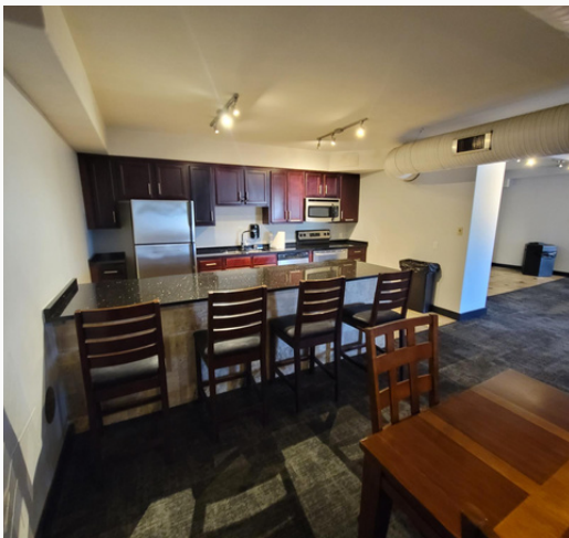
Game Room Bar