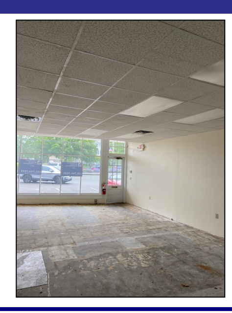
Great Building located on busy Main St., Trumbull