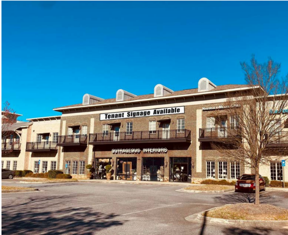
335 Peachtree Industrial Blvd, Suwanee, Georgia 30024

335 PEACHTREE INDUSTRIAL BLVD, SUWANEE, GA 30024