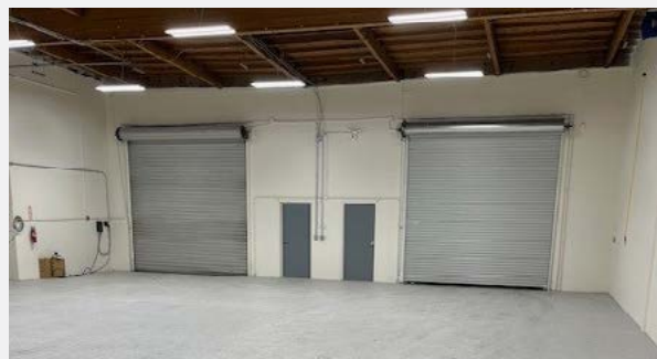
Two roll up doors & New epoxy floor