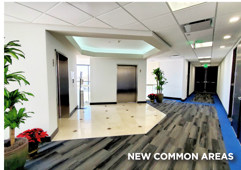
NEW COMMON AREAS