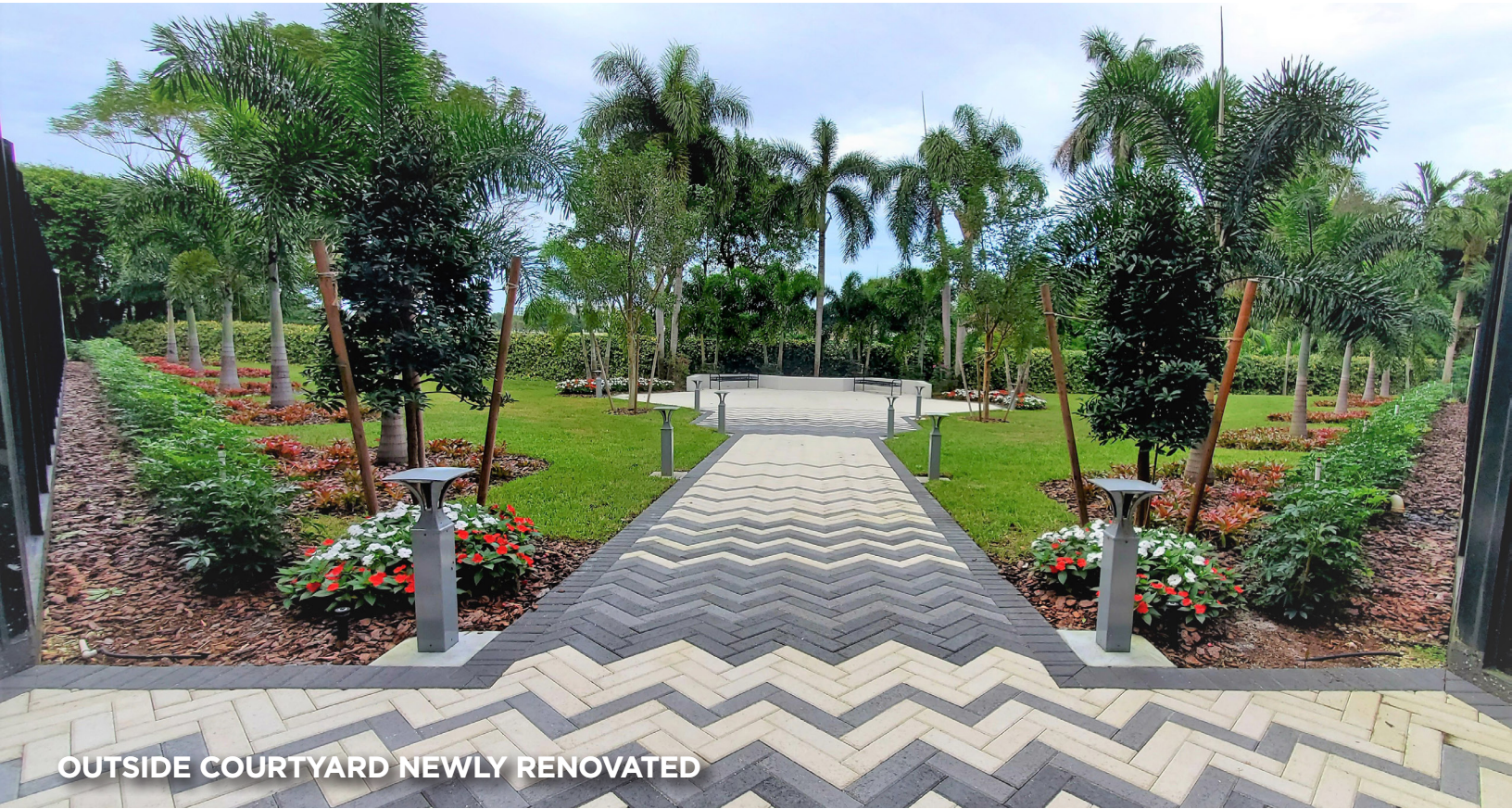
OUTSIDE COURTYARD NEWLY RENOVATED