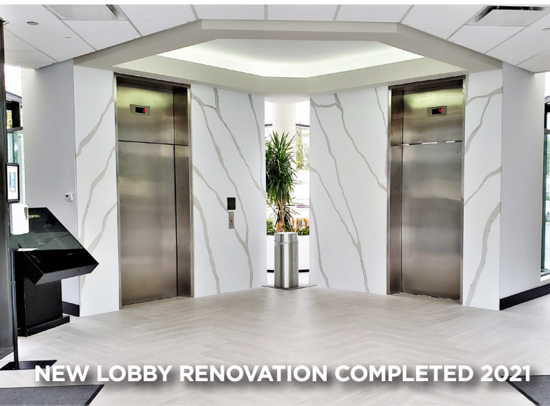
NEW LOBBY RENOVATION COMPLETED 2021