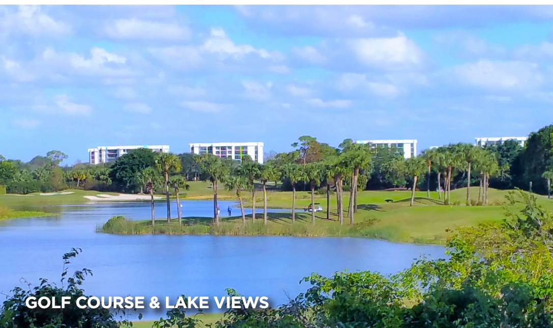
GOLF COURSE & LAKE VIEWS