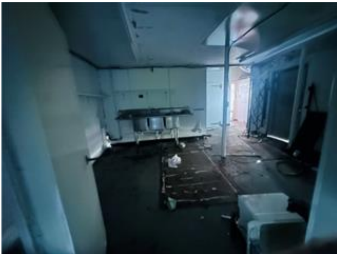
11810 Blue Ridge Blvd Liquor store