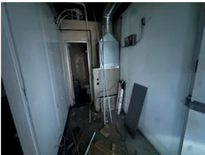
11810 Blue Ridge Blvd Liquor store