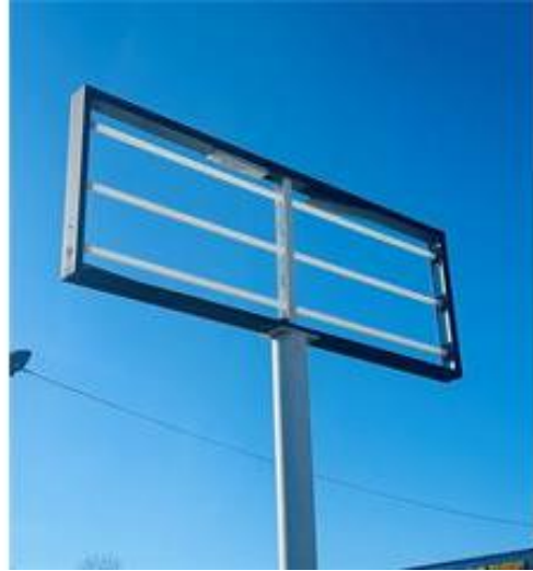
11818 Blue Ridge Blvd pole sign