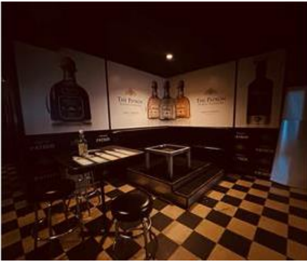
11816 Blue Ridge Blvd Bar / Lounge VIP