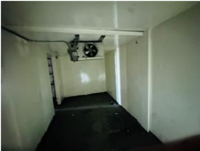
11810 Blue Ridge Blvd Liquor store cooler