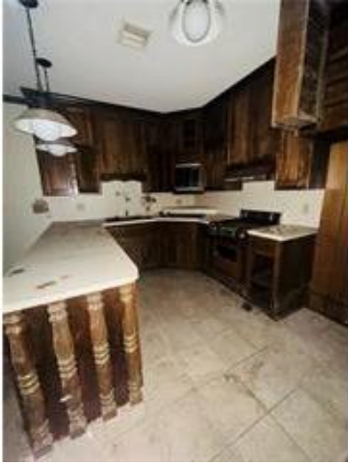
11818 Blue Ridge Blvd