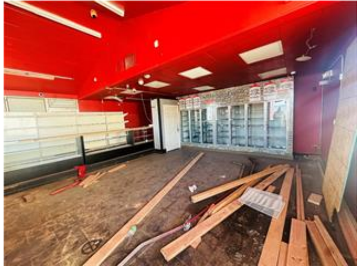
11810 Blue Ridge Blvd Liquor store