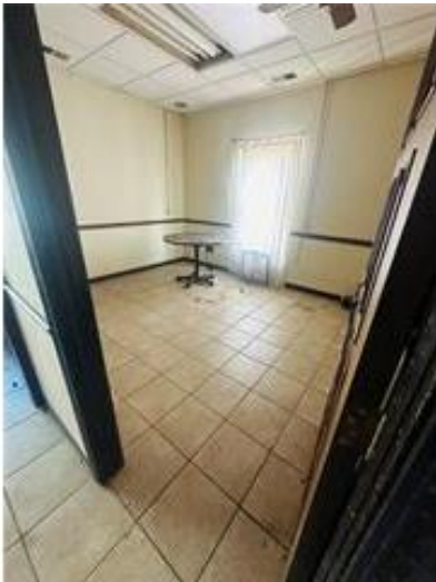
11818 Blue Ridge Blvd office