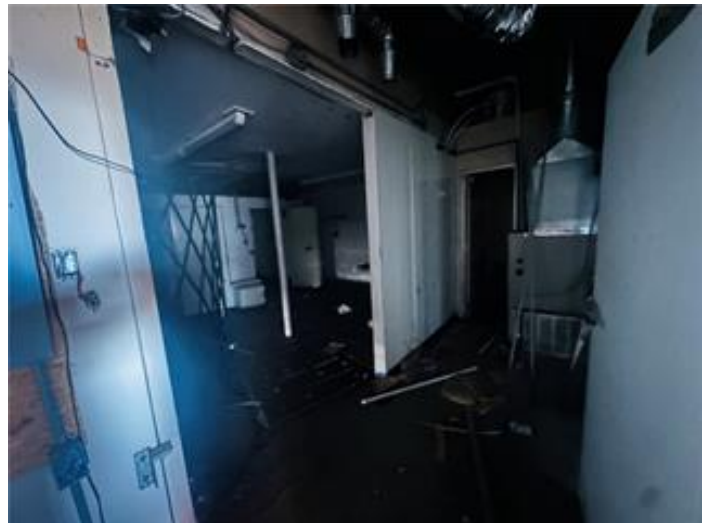
11810 Blue Ridge Blvd Liquor store cooler