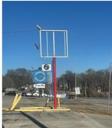
11810 Blue Ridge Blvd Liquor store sign