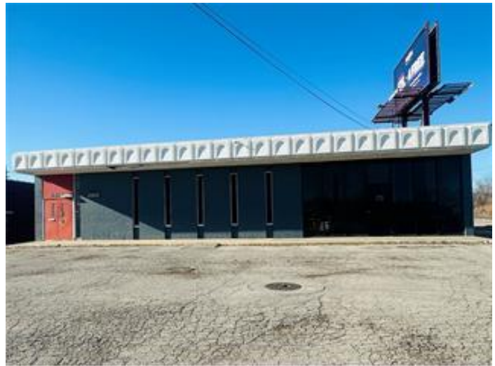
11816 Blue Ridge Blvd Bar / Lounge