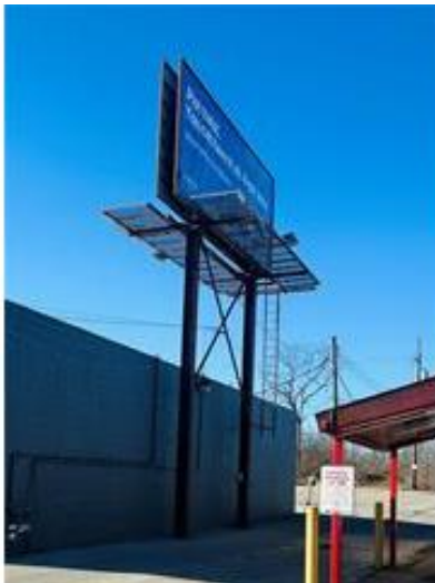
Billboard included in sale