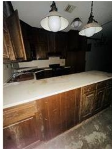
11818 Blue Ridge Blvd