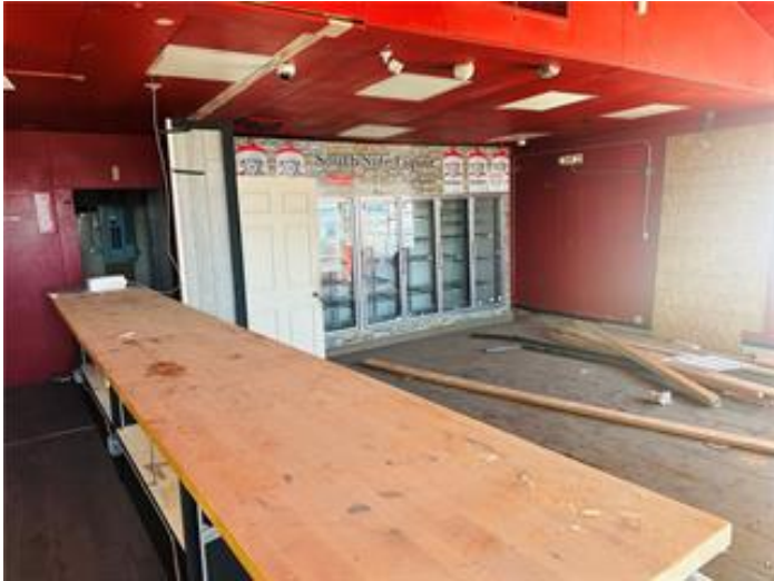
11810 Blue Ridge Blvd Liquor store Liquor store front counter