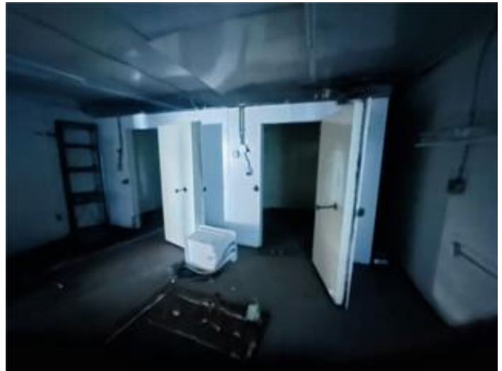
11810 Blue Ridge Blvd Liquor store