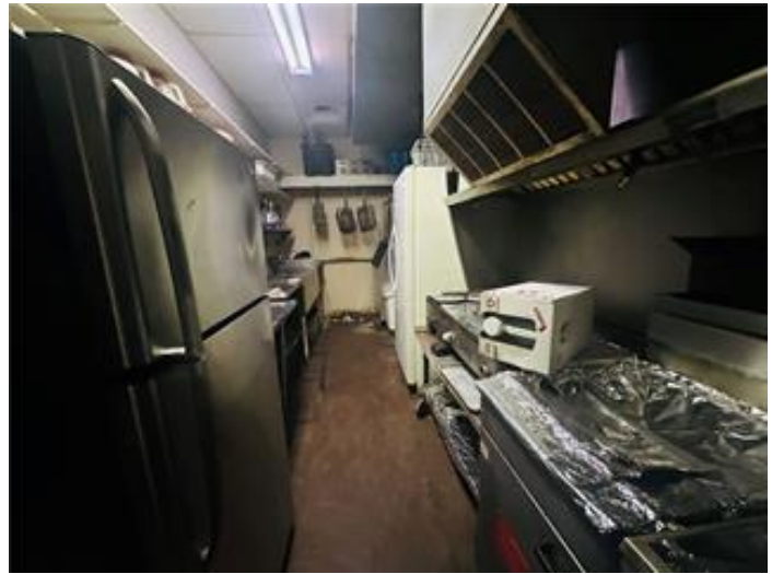
11816 Blue Ridge Blvd Bar / Lounge kitchen