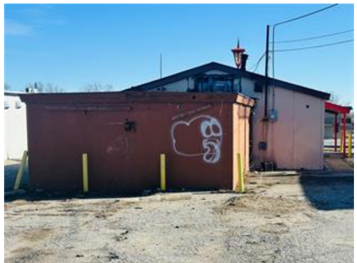
11810 Blue Ridge Blvd rear of building Liquor store rear of building