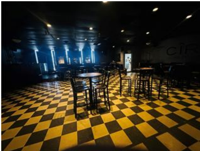
11816 Blue Ridge Blvd Bar / Lounge Bar area