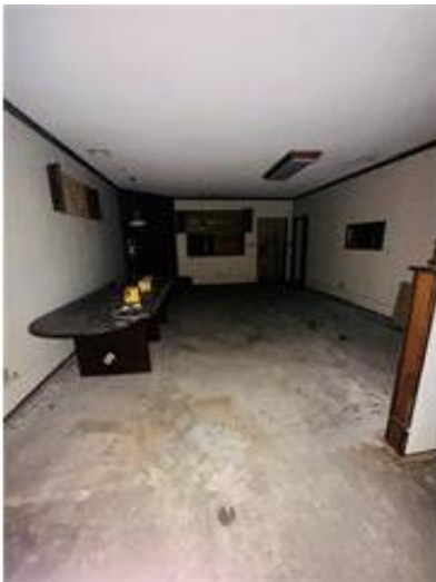
11818 Blue Ridge Blvd with fireplace