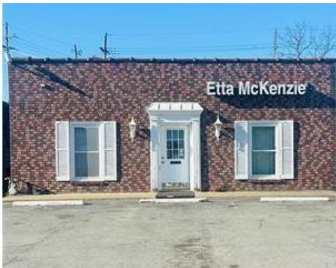
11818 Blue Ridge Blvd