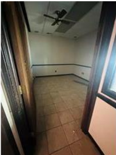
11818 Blue Ridge Blvd office