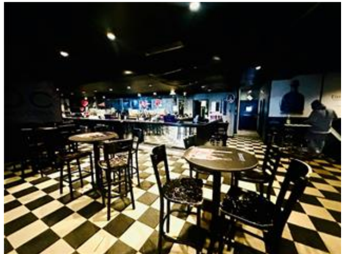
11816 Blue Ridge Blvd Bar / Lounge Bar area