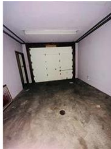
11818 Blue Ridge Blvd