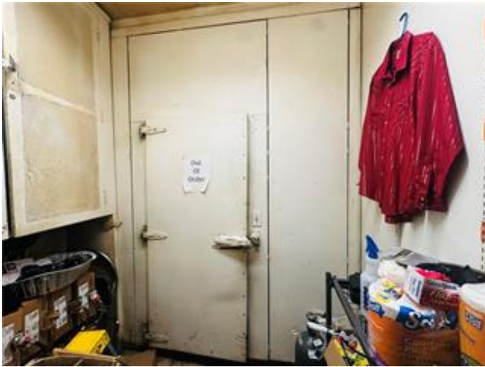
11816 Blue Ridge Blvd Bar / Lounge cooler