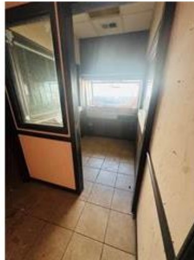
11818 Blue Ridge Blvd Drive in window