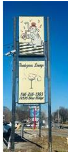
11816 Blue Ridge Blvd Bar / Lounge