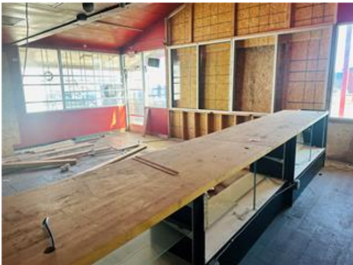
11810 Blue Ridge Blvd Liquor store Liquor store front counter