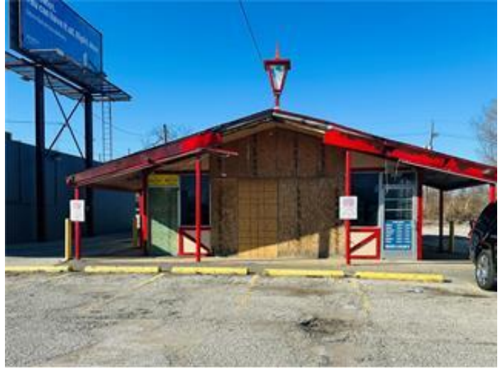
11810 Blue Ridge Blvd Liquor store