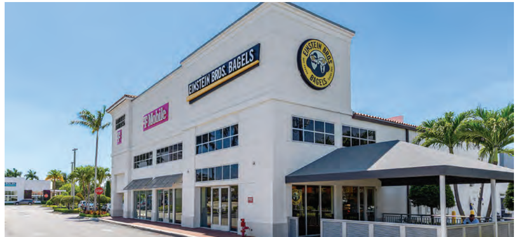
PALM BEACH MARKETPLACE