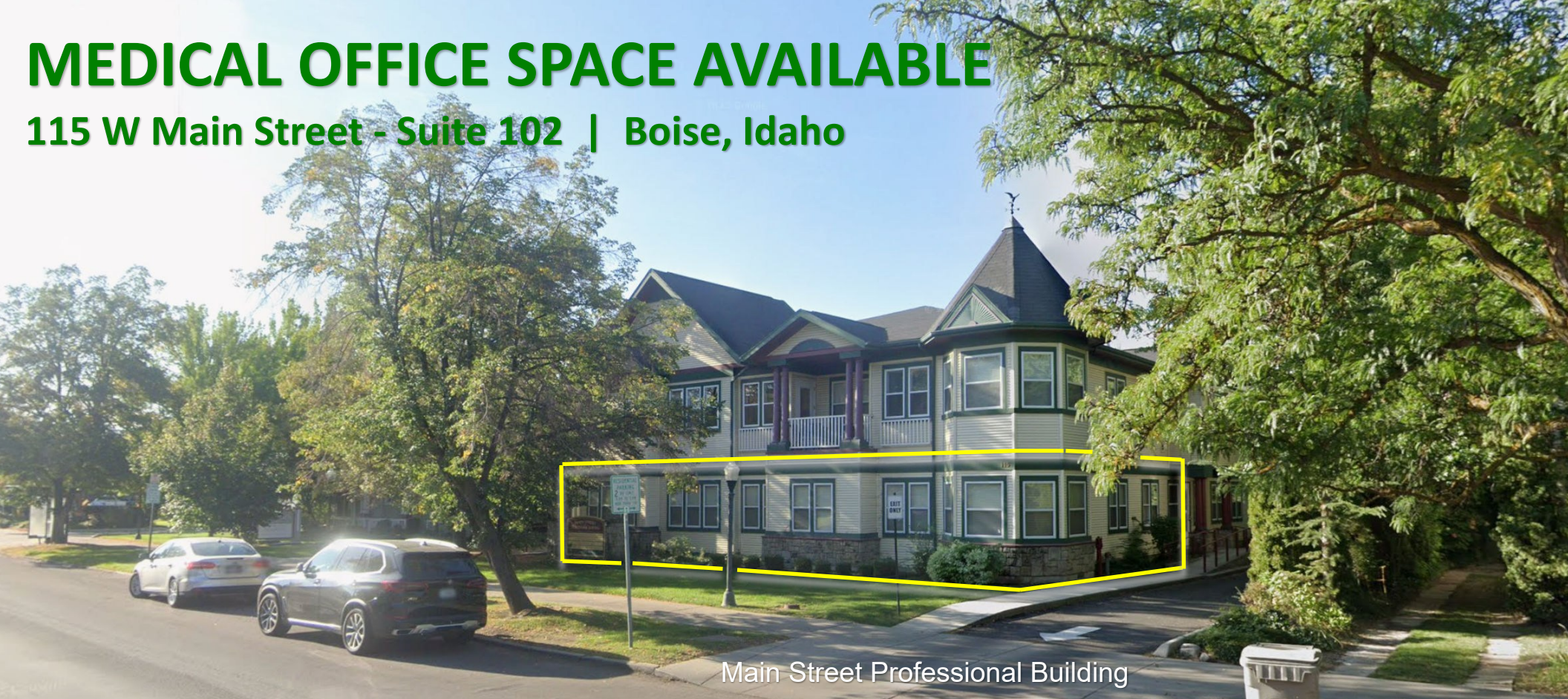
Main Street Professional Building

115 W Main Street - Suite 102 | Boise, Idaho