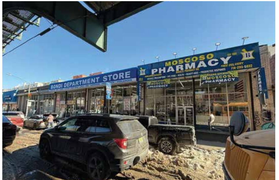
1412 Jerome Ave, Bronx NY, 10452 Btwn E 171 st St & E 170th St