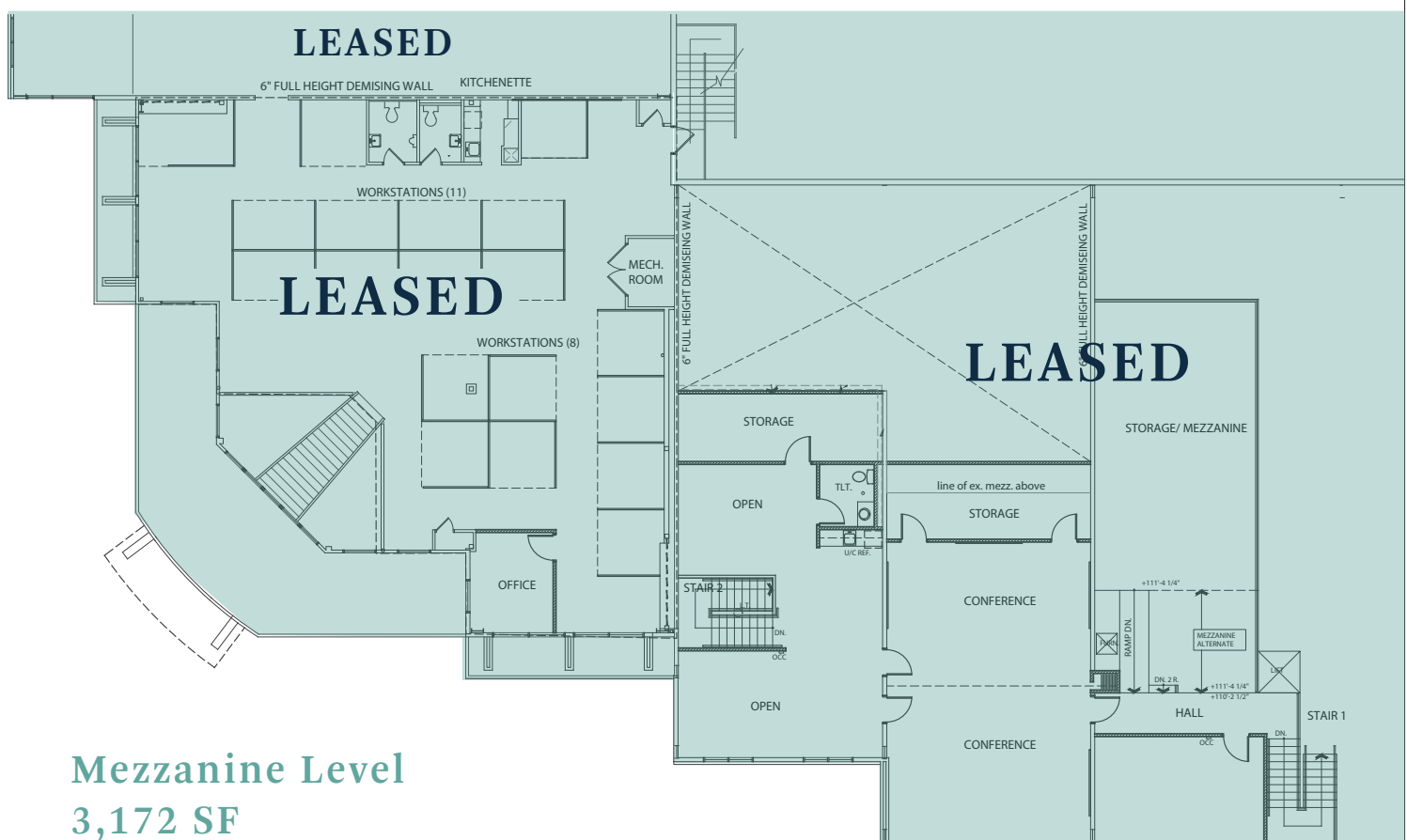
Mezzanine Level 3,172 SF