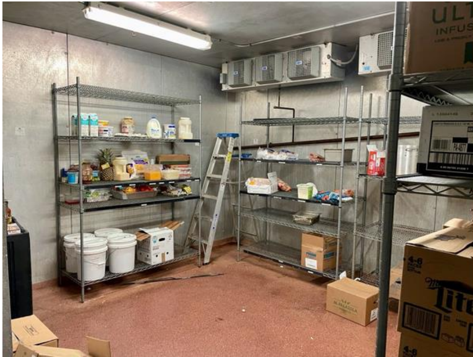
Walk-In Refrigerator Approx. 12' x 15'