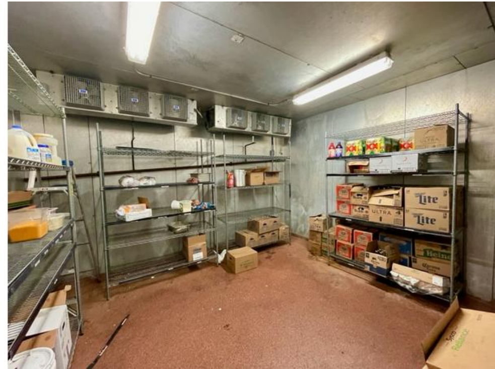
Walk-In Freezer Approx. 7' x 15'