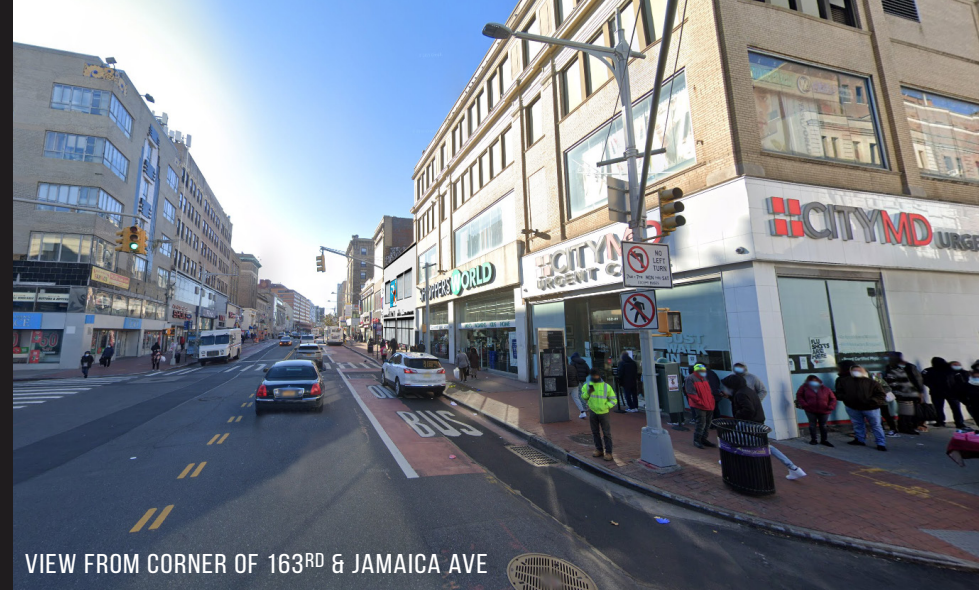
VIEW FROM CORNER OF 163 RD & JAMAICA AVE