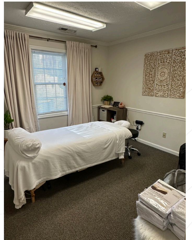
1310-1312 VINCENT PLACE MCGLEAN, VA