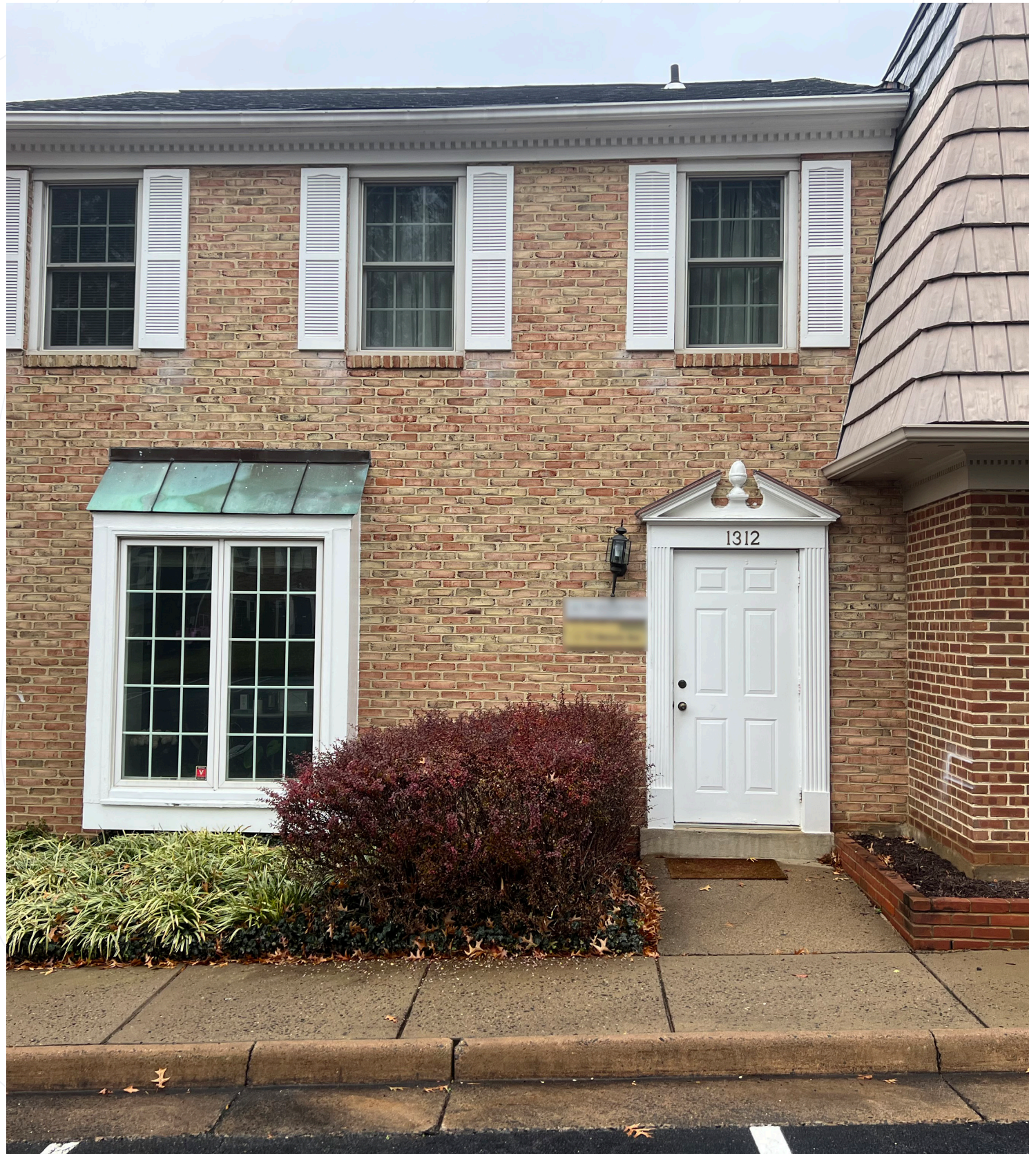
1310-1312 VINCENT PLACE MCGLEAN, VA