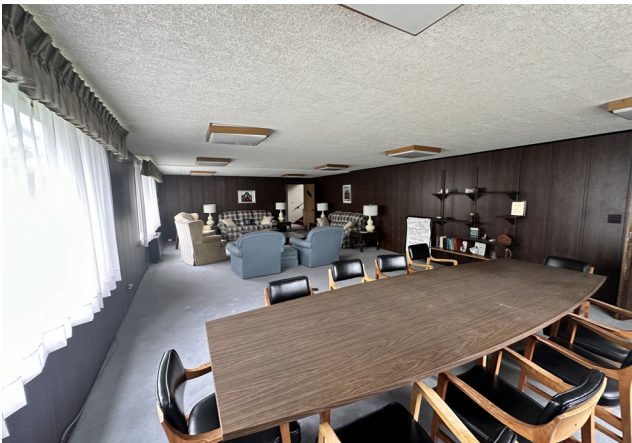
Rectory Living Room