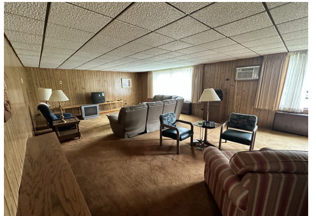
Rectory Entertainment Room