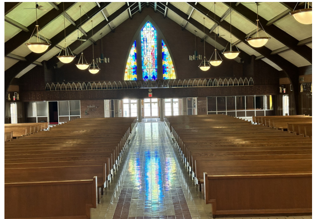
Sanctuary View from Front