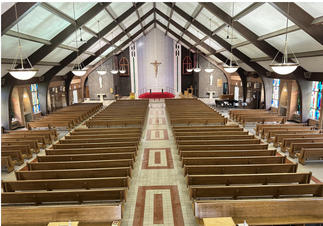
Sanctuary View from Back