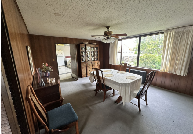
Rectory Dining Area