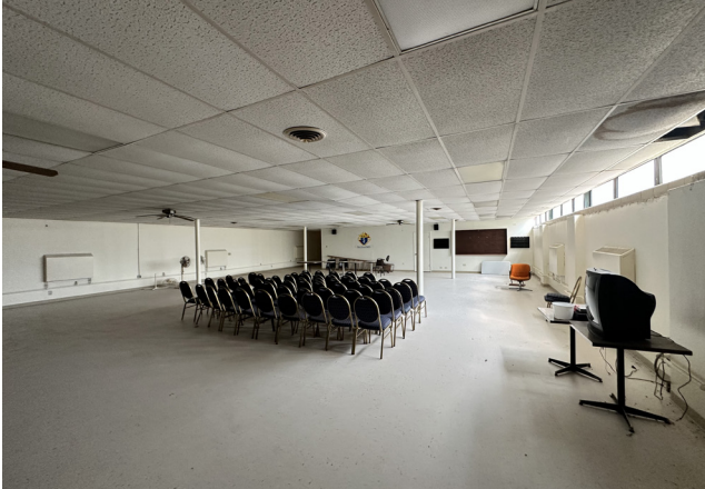
Large Meeting Area