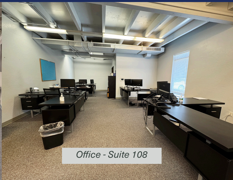
Office - Suite 108