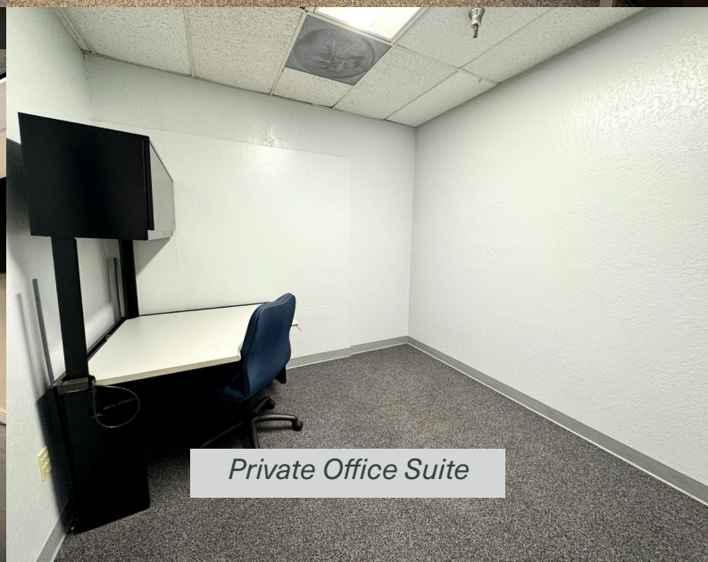
Private Office Suite