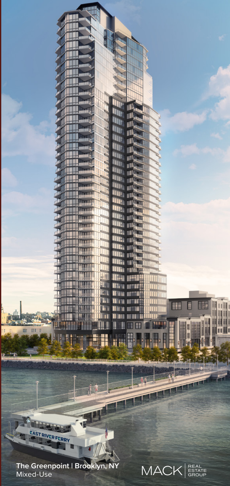
The Greenpoint | Brooklyn, NY Mixed-Use