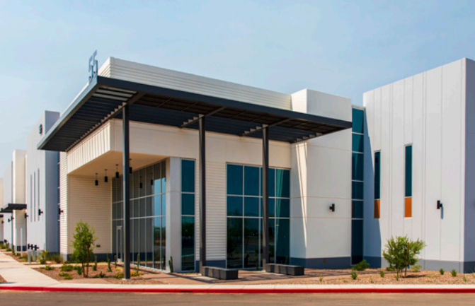
Mack Innovation Park | Deer Valley, AZ Industrial