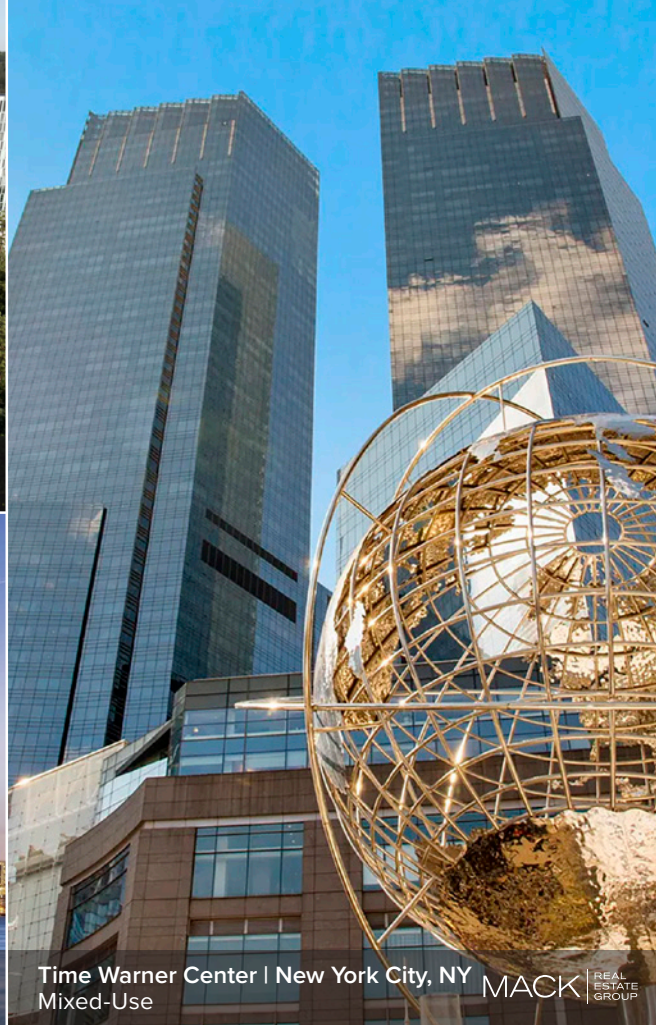
Time Warner Center | New York City, NY Mixed-Use