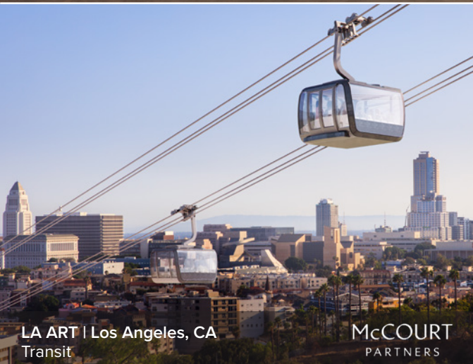
LA ART | Los Angeles, CA Transit