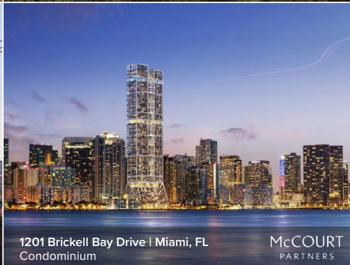
1201 Brickell Bay Drive | Miami, FL Condominium