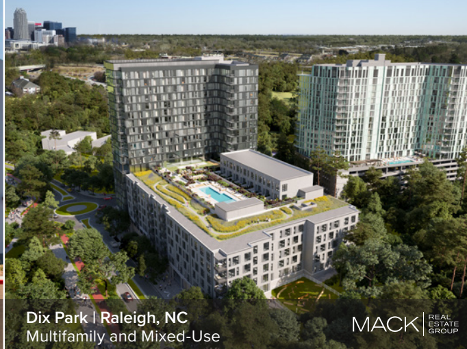
Dix Park | Raleigh, NC Multifamily and Mixed-Use