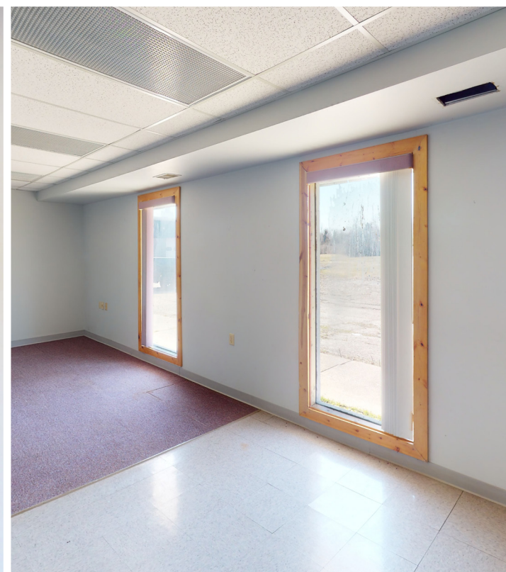
1213 N U.S. 127 BR | For Sale or Lease