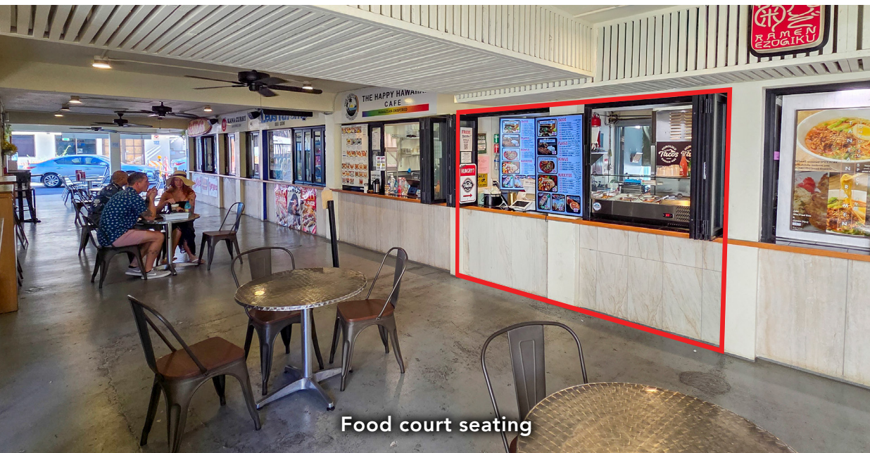
Food court seating