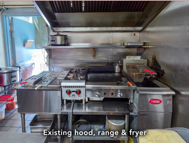
Existing hood, range & fryer