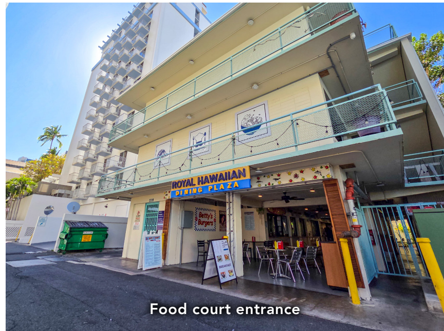
Food court entrance