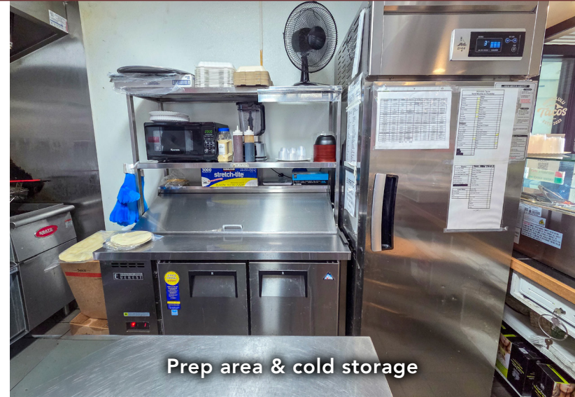
Prep area & cold storage