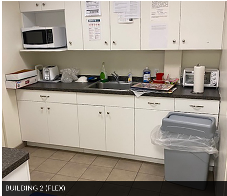
BUILDING 2 (FLEX)