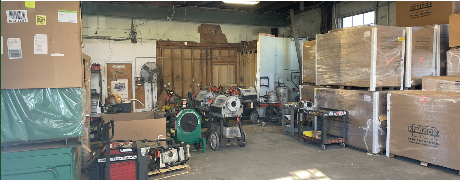
BUILDING 3 (MAINTENANCE SHOP)