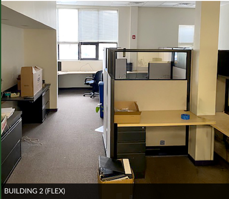
BUILDING 2 (FLEX)