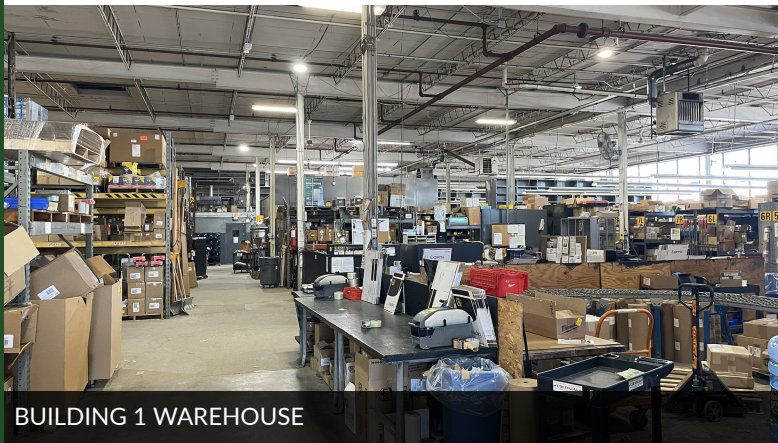
BUILDING 1 WAREHOUSE