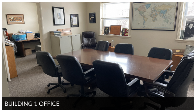
BUILDING 1 OFFICE