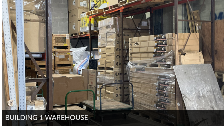
BUILDING 1 WAREHOUSE