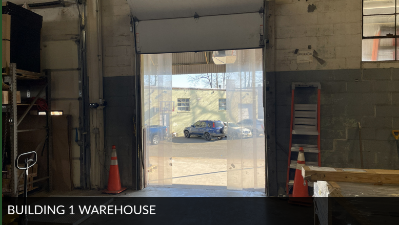
BUILDING 1 WAREHOUSE