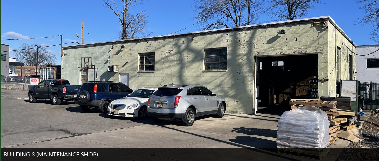
BUILDING 3 (MAINTENANCE SHOP)