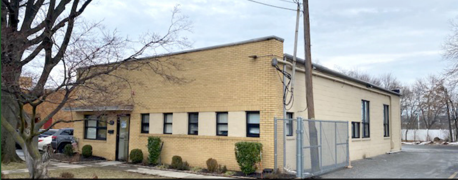
BUILDING 2 (±2,800 SF FLEX)