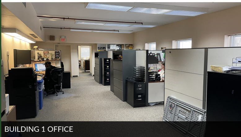
BUILDING 1 OFFICE