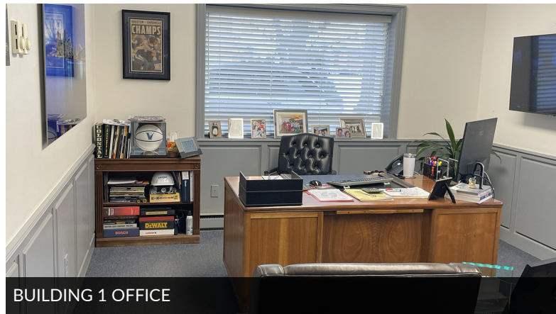
BUILDING 1 OFFICE