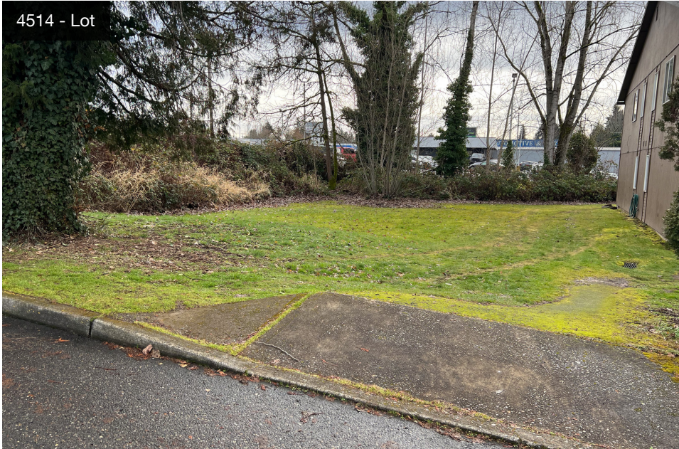
4514 - Lot