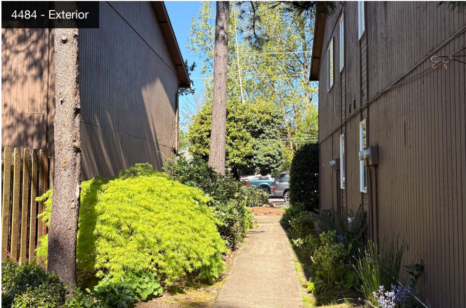
4484 - Exterior