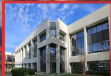
3 CENTERVIEW DR.