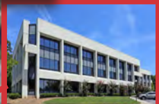
2 CENTERVIEW DR.