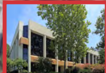
1 CENTERVIEW DR.