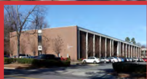
2300 W. MEADOWVIEW RD.