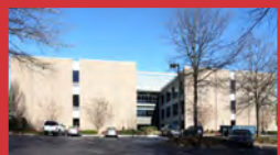
2303 W. MEADOWVIEW RD.