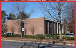
2302 W. MEADOWVIEW RD.