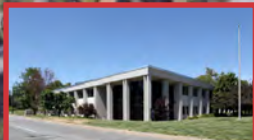
2306 W. MEADOWVIEW RD.