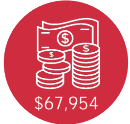
AVG HOUSEHOLD INCOME