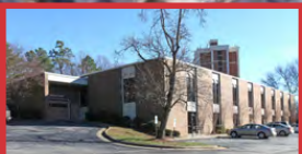
2211 W. MEADOWVIEW RD.