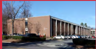
Wrightsville Office Building 2300 W. Meadowview Rd.