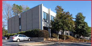
Wilmington Office Building 2216-2301 W. Meadowview Rd.