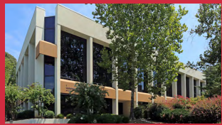
Rockingham Office Building 1 Centerview Dr.