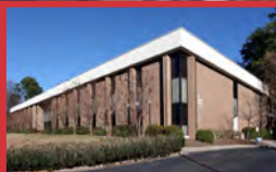
5 CENTERVIEW DR.