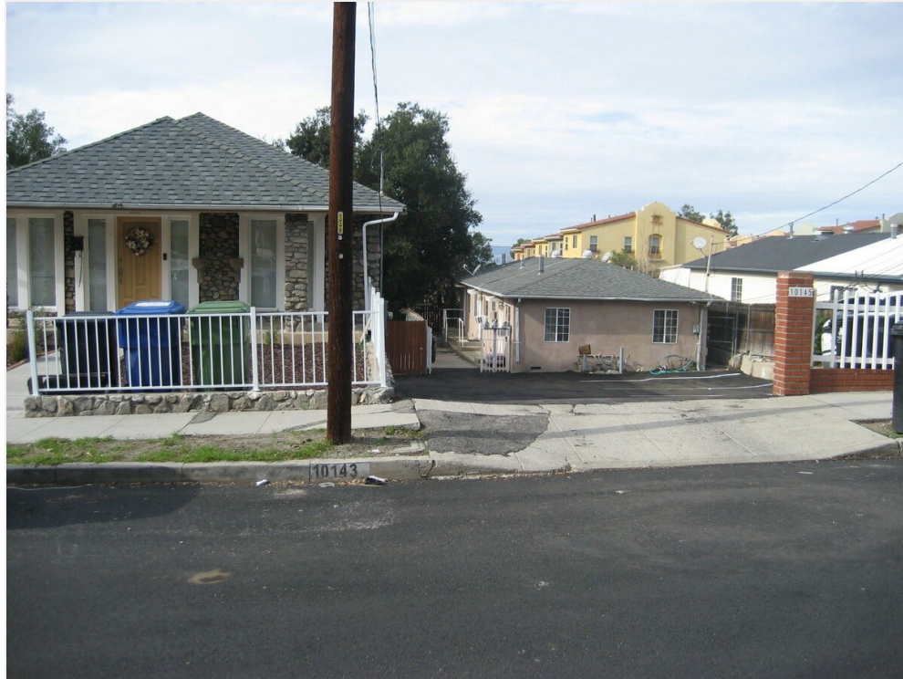
6 10143 and 10145 Buildings C