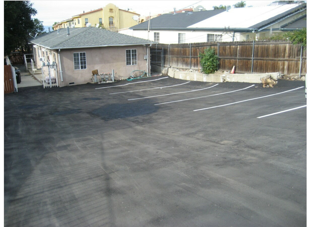
5 10145 Building