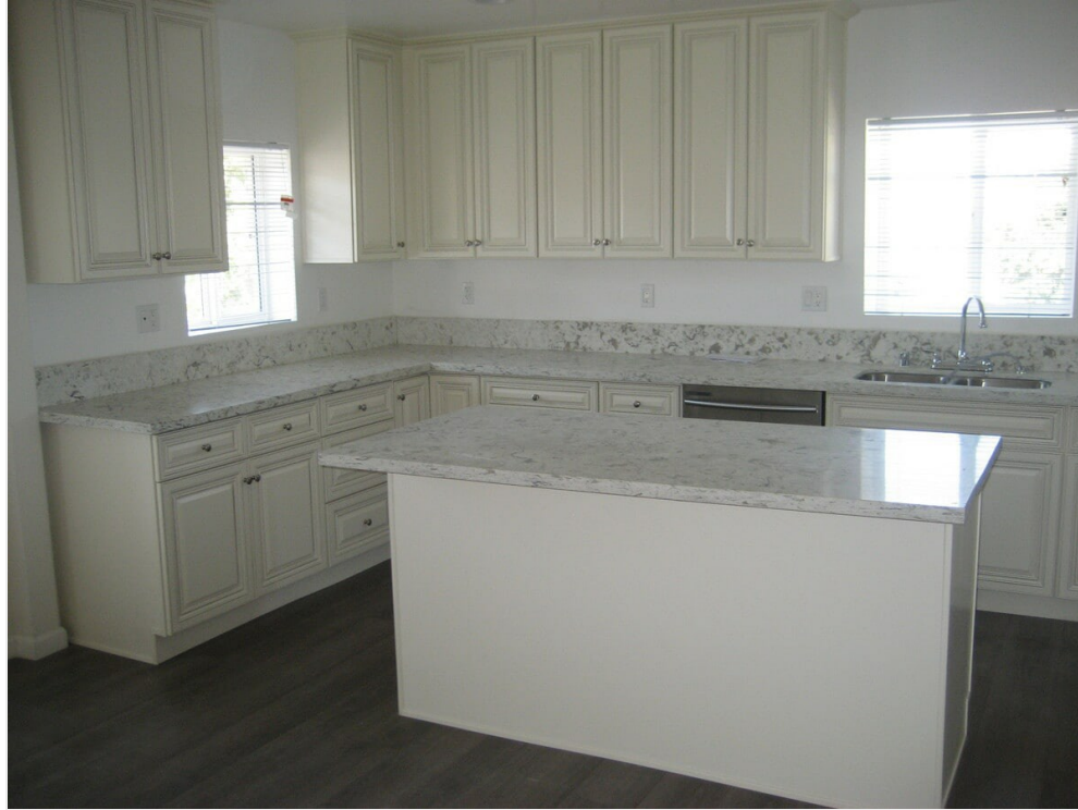
4 Kitchen Area 10143