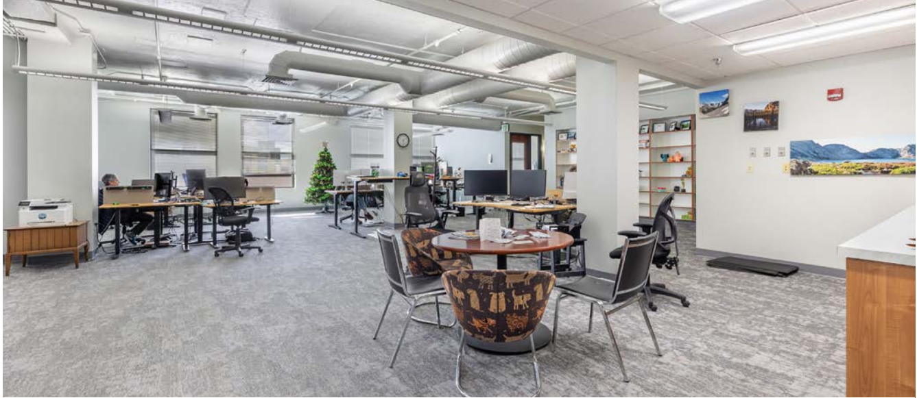
SUITE 400 | CLASS A FINISHES