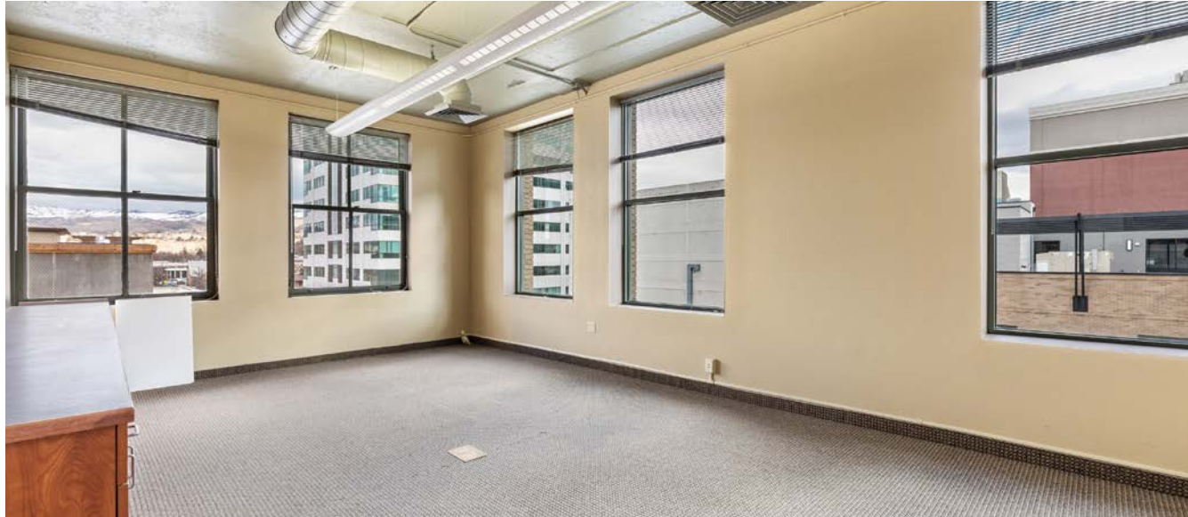
SUITE 410 | HIGH QUALITY OFFICE SPACE