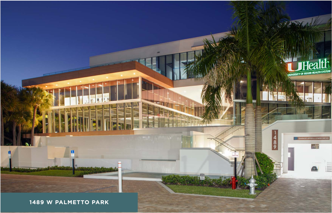
1489 W PALMETTO PARK