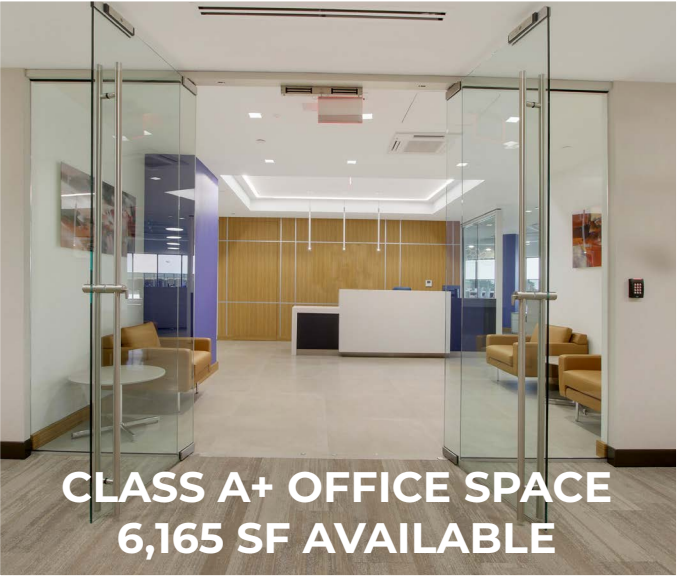
CLASS A+ OFFICE SPACE 6,165 SF AVAILABLE