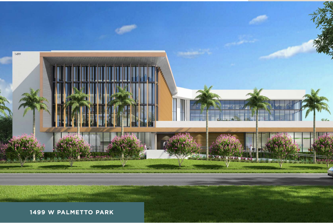
1499 W PALMETTO PARK