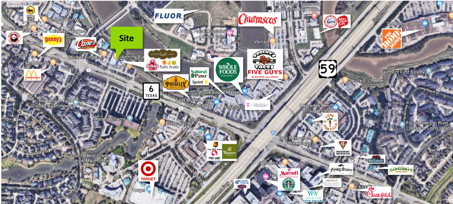
(Pitney Bowes data accessed from CoStar.com 2019)