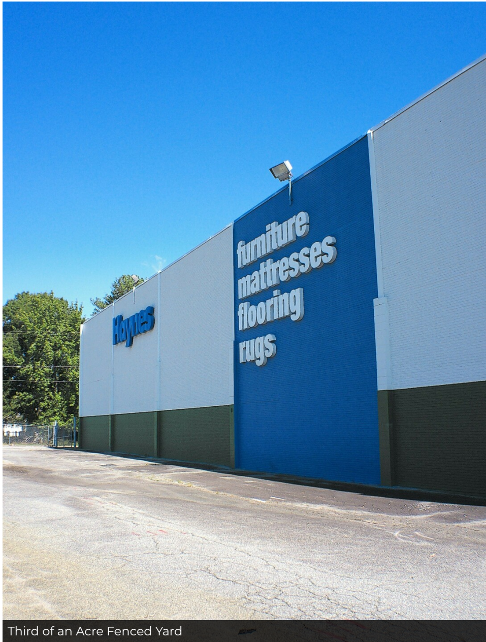
Third of an Acre Fenced Yard