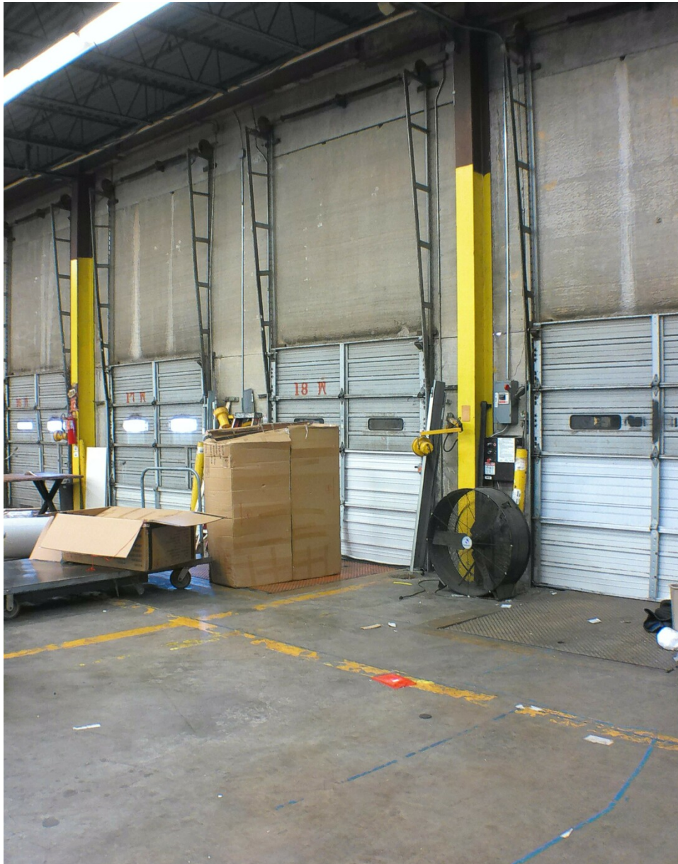
2 Dock-Height Doors