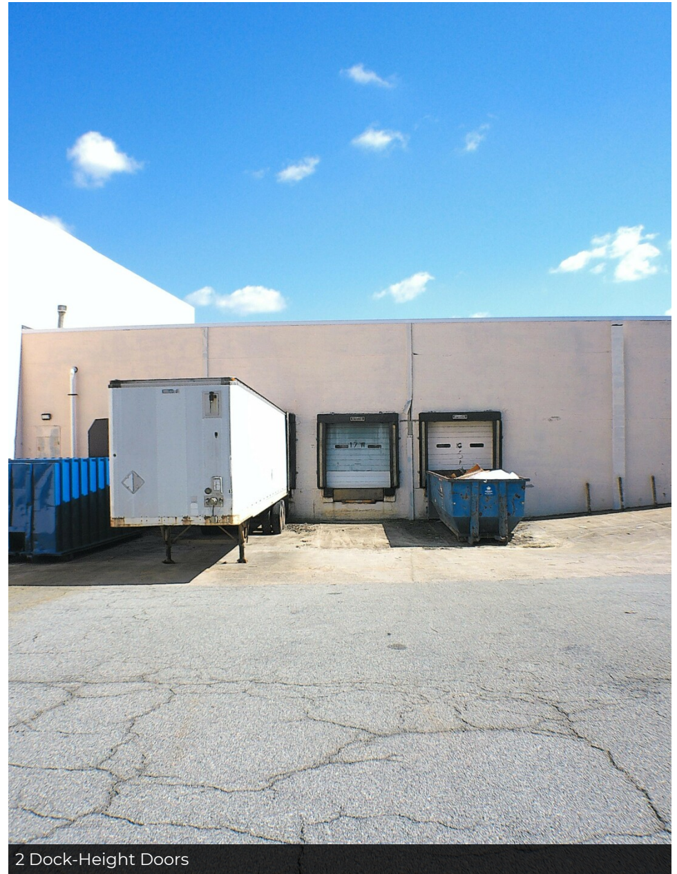
2 Dock-Height Doors