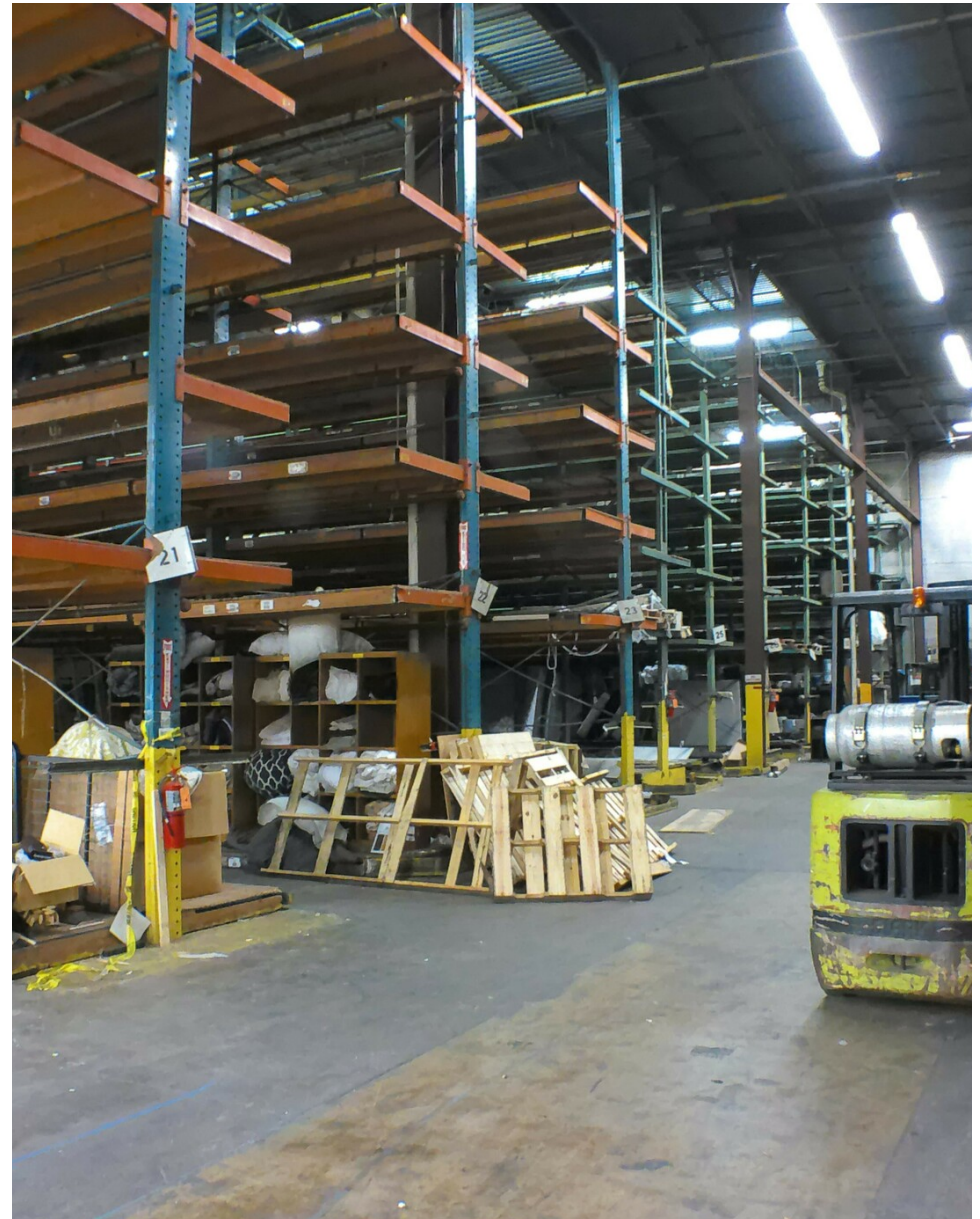
10 Dual Racks + 2 Single Racks