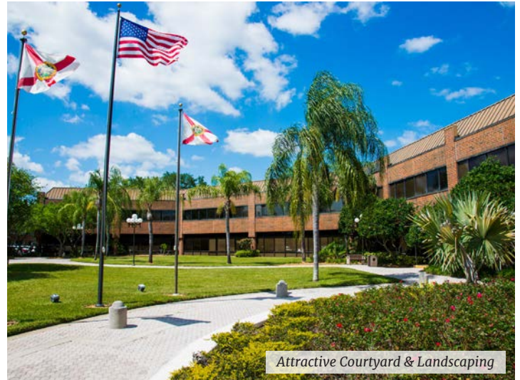
Attractive Courtyard & Landscaping