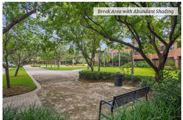
Break Area with Abundant Shading