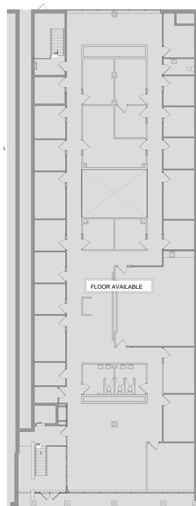
3 UPPER LEVEL FLOOR PLAN 1/8" = 1'-0"