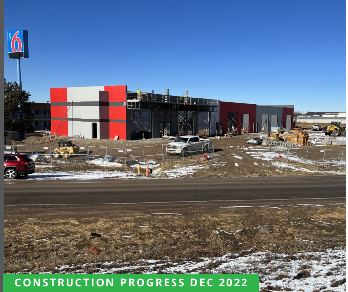
CONSTRUCTION PROGRESS DEC 2022