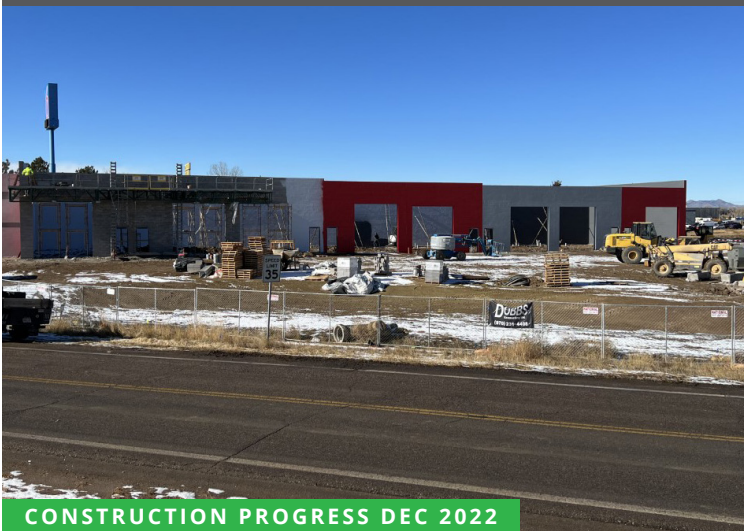
CONSTRUCTION PROGRESS DEC 2022