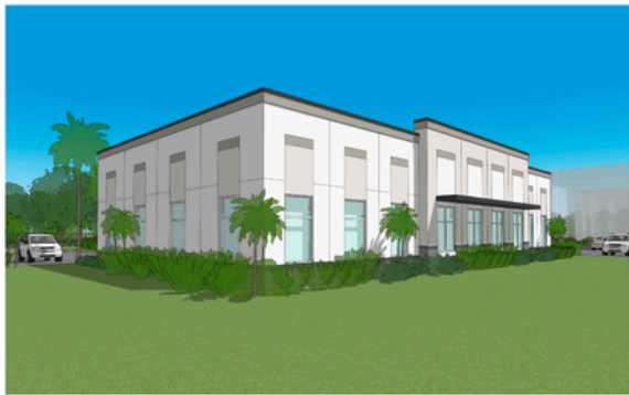
04 LOOKING SOUTHEAST