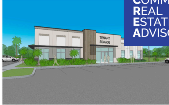
01 LOOKING WEST