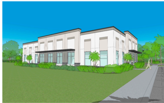
02 LOOKING NORTHEAST