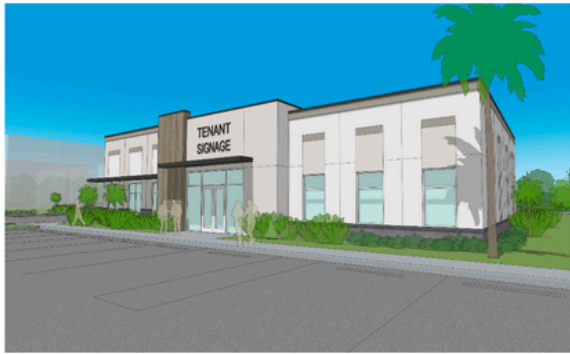
03 LOOKING SOUTHWEST