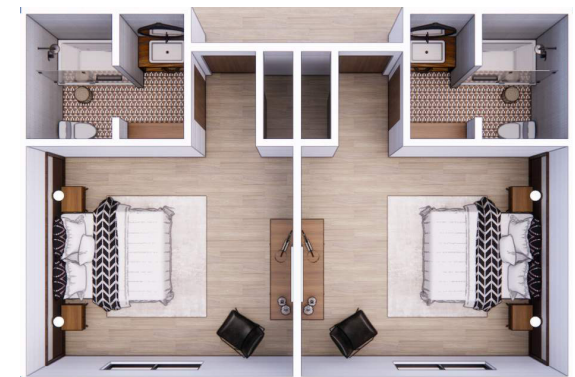
STANDARD KING ROOM