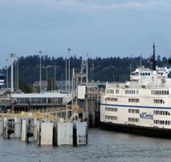
TSAWWASSEN FERRY TERMINAL • 22 MIN DRIVE