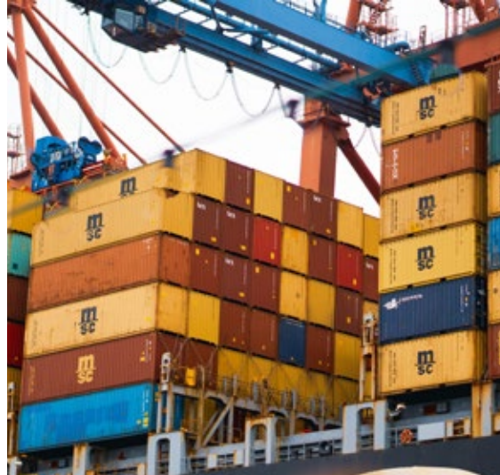
DELTA PORT CONTAINER TERMINAL • 23 MIN DRIVE